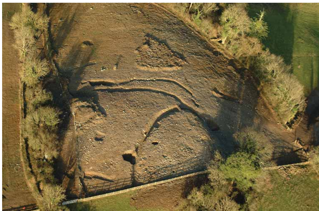
Illus. 18—Aerial view of medieval Fort Hill motte and bailey (Studio Lab)

the ninth and early tenth centuries—the apparent period of most frequent souterrain construction.