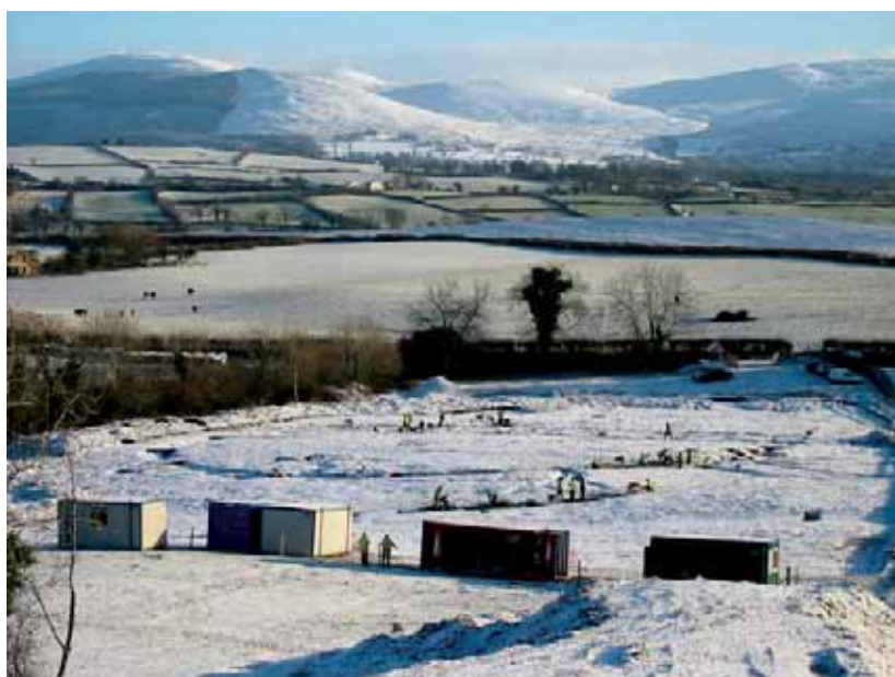
Illus. 16—Main enclosure at Balriggeran under excavation in the snow looking in the direction of the Great North Road (Niall Roycroft)

a large corn-drying kiln, still full of charred seeds, and two charcoal clamps were found. No souterrain was located within the lands made available.