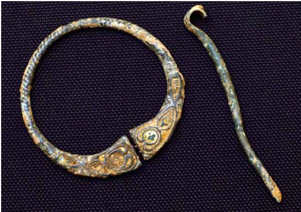
Illus. 9—Penannular brooch (41 mm diameter) found in the enclosure ditch at Newtownbalregan (Studio Lab)