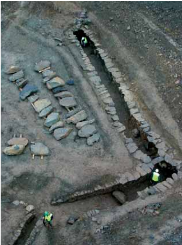
Illus. 12—Souterrain 2 at Tateetra under excavation (Niall Roycroft)