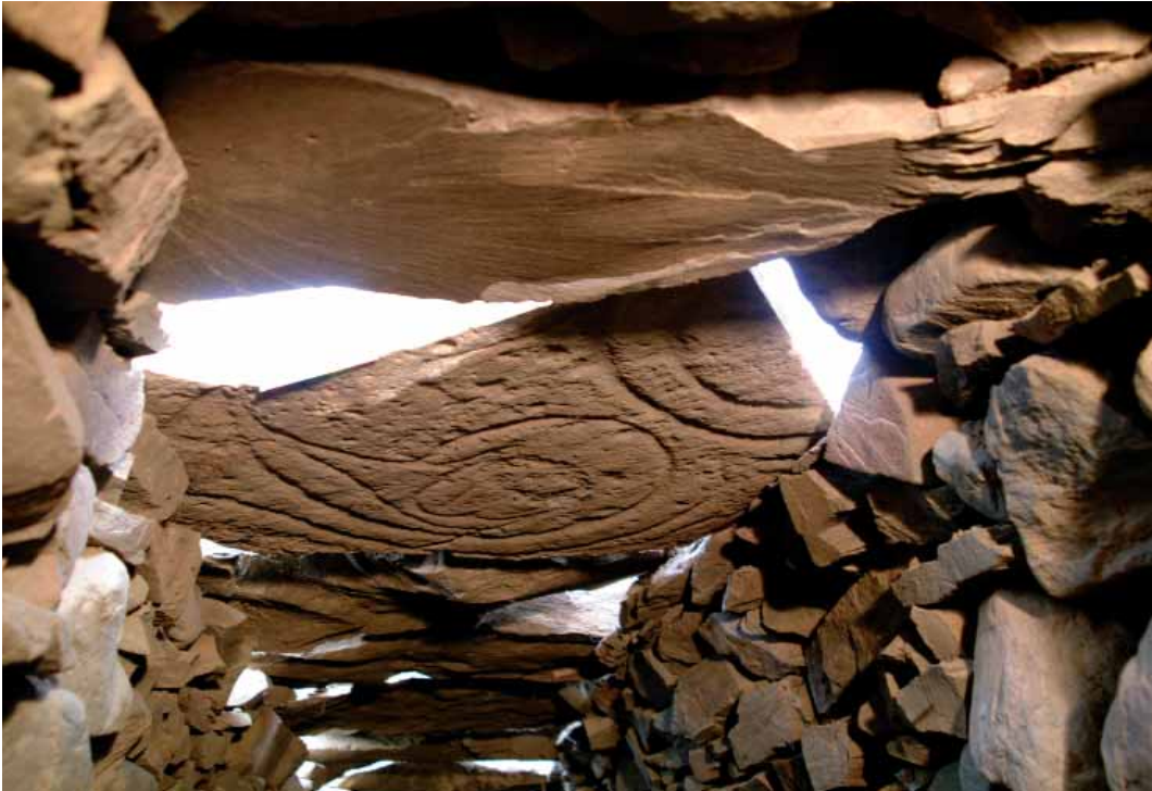
Illus. 7—Detail of the decorated stone found within the Newtownbalregan souterrain (B O'Connor)

barrier to prevent them being placed closer to the central burial. It seems the cists and central burial were part of a single construction plan.