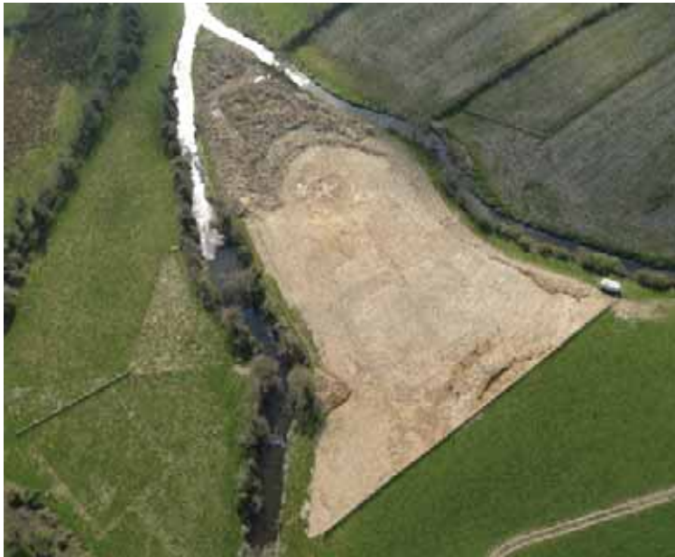
Illus. 2—Aerial view of the Balregan site showing the curving henge bank. The barrow and river confluence are in the background