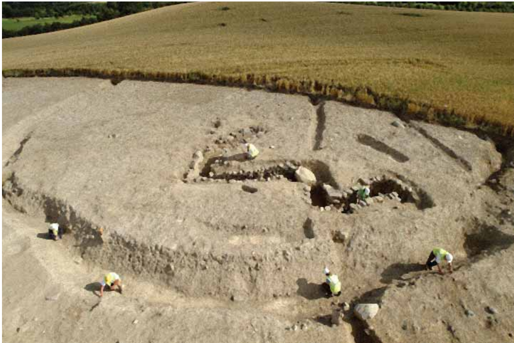
Illus. 17—Ringfort and souterrain at Carn More under excavation (Studio Lab)

length, constructed wholly with field-collected stones. The entrance sloped down to a zig-zag gallery with no breaks or internal features. It seems that there was an exit from the souterrain up through the encircling ringfort bank. Found inside the souterrain backfill were fragments of human skull and teeth, but it is not known how they came to be there or whether, for instance, there is an unknown burial ground close by.