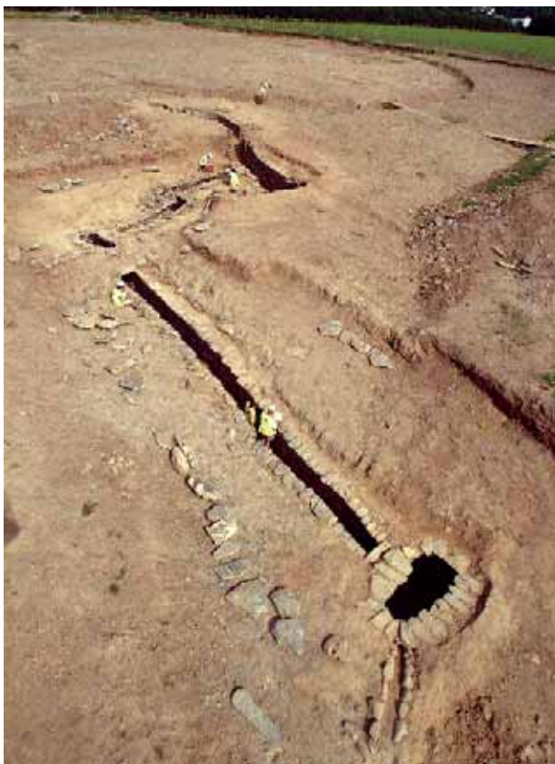
Illus. 10—Newtownbalregan souterrain under excavation with the Cooley mountains in the background (Studio Lab)