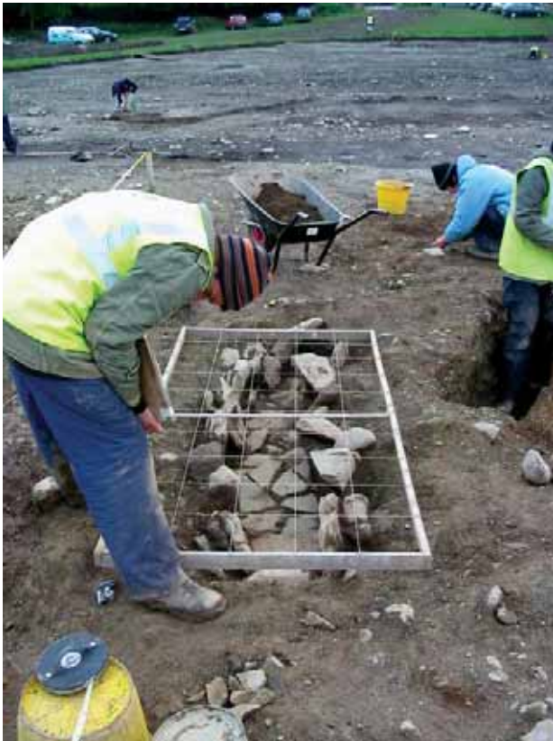
Illus. 15—Early medieval grave at Balriggan under excavation (Niall Roycroft)

similar to an internal door at Newtownbalregan. In the gallery of Souterrain 1 a broken Souterrain Ware vessel was recovered, probably acting as a lamp, and in the backfill of the joint entrance chamber a copper-alloy pin of around 11th-century date was found.