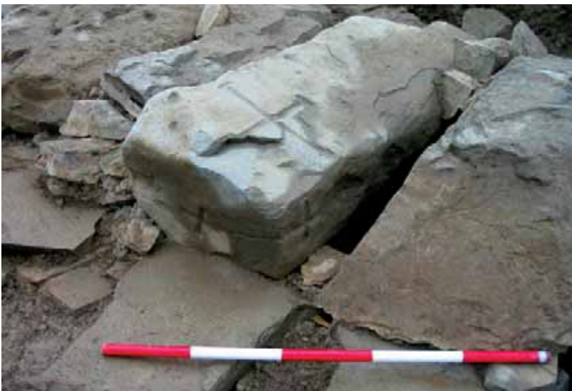
Illus. 13—Detail of the cross-inscribed stone re-used within the Tateetra Souterrain 2 (Niall Roycroft)

Inside the ringfort, a cluster of pits and post-holes indicated the main domestic buildings were on the southern side. The northern side of the interior was empty and probably used for corralling stock. Over 200 pieces of struck flint were recovered from the ringfort ditch, possibly connecting the site with leather working; very sharp cutting edges being useful in hide working. A small copper-alloy penannular brooch (Illus. 9) was discovered in the enclosure ditch, along with some superbly decorated glass beads, Souterrain Ware pottery and other dress pins.