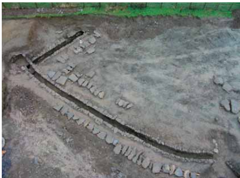
Illus. 11— Souterrain 1 at Tateetra, drophole near Chamber 1 under excavation (Niall Roycroft)

Early Bronze Age pottery, 13 virtually complete Bronze Age pottery vessels (the 12 from the Carn More cemetery plus a polypod vessel from Newtownbalregan 2), 9 more than 450 struck flints, nine metal items and seven worked or decorated stone objects. Much of the pottery is from the Balregan henge and it is likely that many intact pots were deliberately smashed during a foundation ritual for this site. This impressive assemblage of roughly contemporary artefacts from a variety of different sites and contexts is an excellent collection for study.