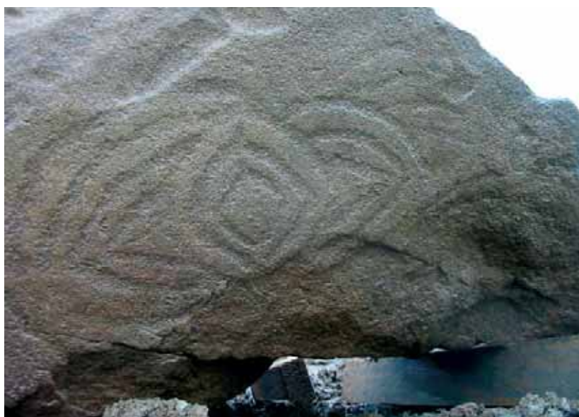
Illus. 6—Decoration on a prehistoric stone re-used within the Täteetra souterrain (Niall Roycroft)

of shallow cups running down the upper side. The 'animal' stone was made of a solid, modified, granite boulder and appears as a resting sheep or cow with a deep hole pierced into one side. A small cairn 5 m in diameter was subsequently built over the central burial and a copper-alloy and apparently iron-filled pommel from a probable ceremonial dagger, and a bronze pin with a twisted faience glass coating were recovered from this cairn.