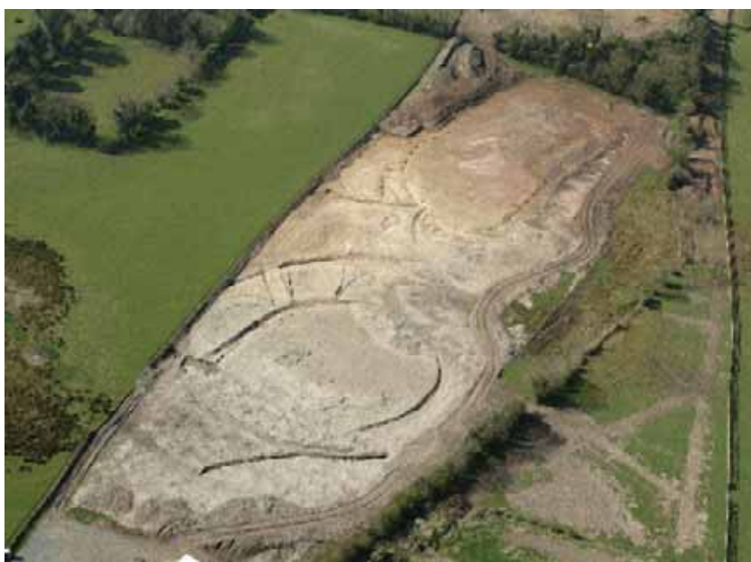
Illus. 14—Aerial view of the Balriggan settlement, the main enclosure is in the foreground, the stock enclosure is in the middle ground. The hill to the rear is Fort Hill

Although the souterrain was identified through a collapsed section, once it had been excavated to a certain depth a series of intact galleries was suddenly revealed. The whole souterrain was then exposed and recorded (Illus. 10). The souterrain was pitched on the sloping hillside with several low galleries or passages and two much larger corbelled chambers with associated external air vents. The whole was excellently made using quarried stone for all parts except for the lowest gallery, which was made of fieldstone.