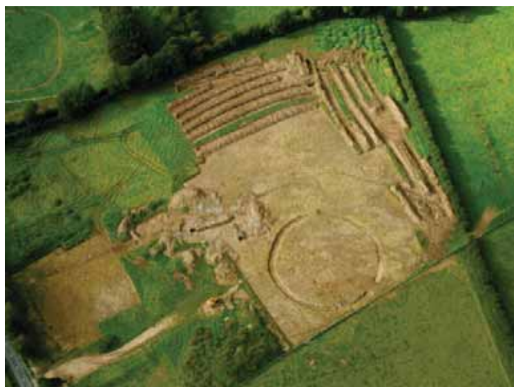
Illus. 8—Aerial view of the ringfort and souterrain at Newtownbalregan (Studio Lab)

Newtownbalregan 4 was a wonderfully decorated stone (Illus. 7). This broken stone displays motifs that are known from 'megalithic art' (c. 1800 BC) such as a 'trumpet' pattern, but is not typical of such stones. The 'paisley' pattern could show Iron Age additions.