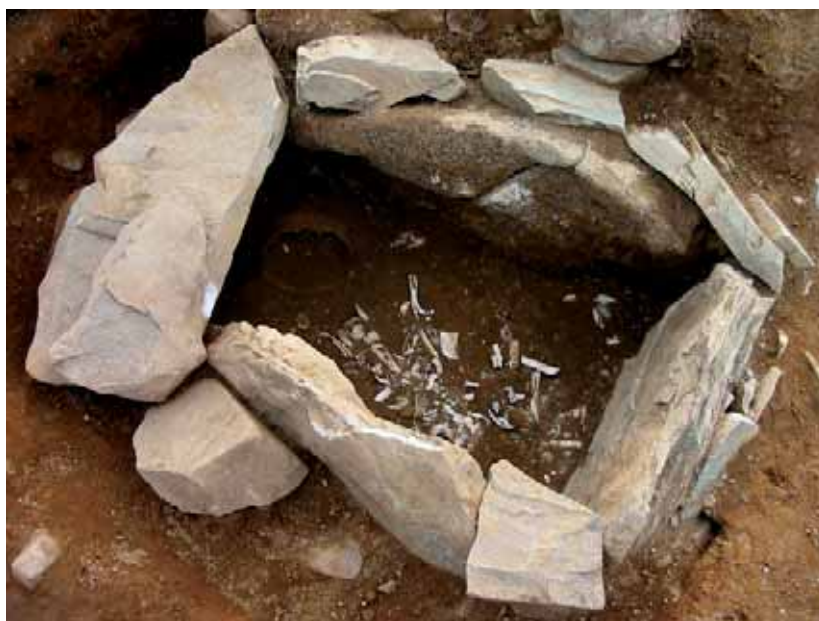
Illus. 5—Detail of the large, granite-capped cist at the Carn More cemetery (Niall Roycroft)