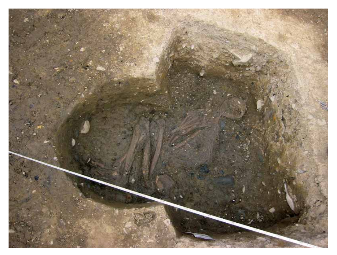
Illus. 3—Decayed skeletal remains of the crouched burial with toe-rings