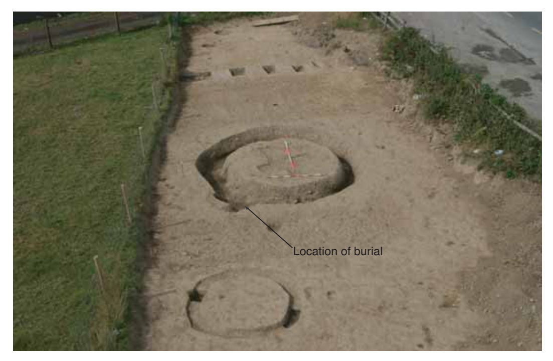
Illus. 2—The excavated barrow in Rath townland showing the location of the burial with the toe-rings