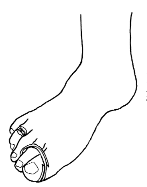
Illus. 5—Artist's sketch of the toe-rings in use, based on their position on the excavated skeletal remains (Cultural Resource Development Services Ltd)

original location of the ring on this foot. The spiral-ring on the right foot, however, was located in situ , meaning that it had been found in the same position as it was at the time of the funeral. The ring was still in an upright position and clasped around the tips of at least two toes (the big toe and the one next to it). Laureen Buckley deduced that the ring would have encircled the top half of the big toe as well as the tips of the second and possibly the third toes (Illus. 5). The third toe-ring, which was decorated with a herring-bone motif, was also found on the right foot, encircling the toe next to the little toe (Illus. 4 and 5).