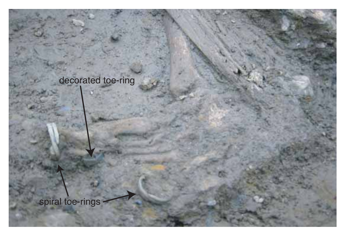
Illus. 4-Detail of the toe-rings on the crouched burial

activity in the form of cremated bone, were evident in the northern half of the ring barrow. The only evidence of burial activity in the southern half of the ditch was represented by a crouched inhumation with the grave dug through the completely backfilled ditch.