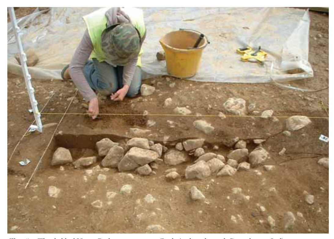
Illus. 5—Threshold of House B, during excavation

House B was of post-and-plank construction. It appeared to have been deliberately abandoned in the final stages of its life, as evidenced by the complete removal of the posts and planks. The process of removing the structural elements disturbed much of the packing fills in the foundation trench. However, evidence of the location of the posts and planks survived as voids in distinct packing or base material throughout most of the foundation trench. The largest post-holes were central to the north and south walls of the house and may have been the main roof supports (there were no significant internal or external structural features). Substantial post-holes were also evident at the corners and at the junction between the inner, dividing wall and the north and south walls. The foundation trench would have supported the plank walls of the house, with subsidiary posts for extra support where necessary. The subsidiary posts were evident in occasional post-holes at the base of the foundation trench. A lower stone-packed deposit was noted throughout most of the foundation trench and would have acted as a firm footing for the posts and planks. The