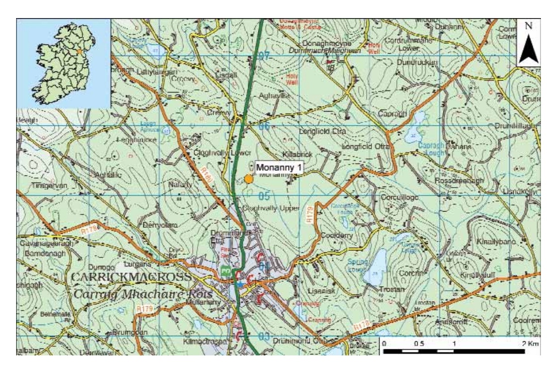
Illus. 1—Location map of Monanny, Co. Monaghan (based on the Ordnance Survey Ireland map)

The construction of the N2 Carrickmacross Bypass provided a great opportunity to investigate the previously unknown archaeological resource of this part of County Monaghan. Nestled between a low drumlin to the north and a small river and large rocky outcrop to the south; a Neolithic settlement site remained hidden in Monanny townland for nearly 6,000 years (Illus. 1).