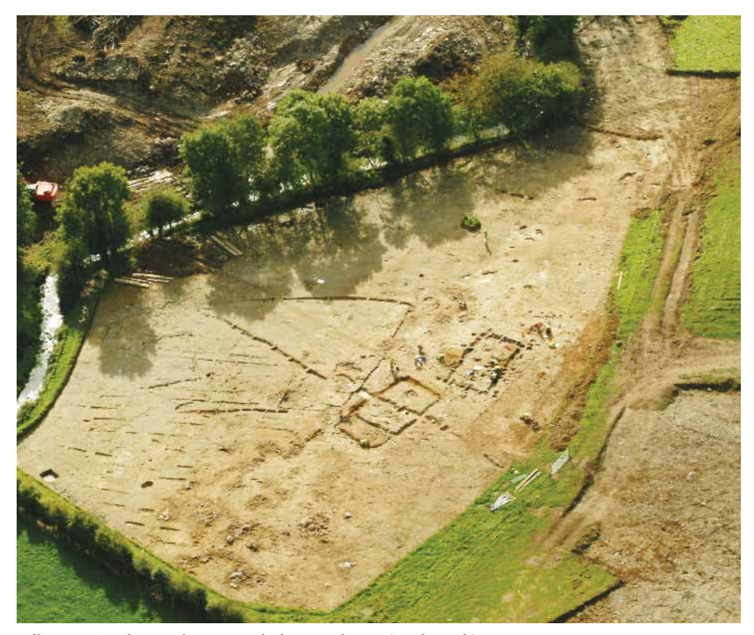
Illus. 3—Aerial view of Monanny, looking south-west (Studio Lab)