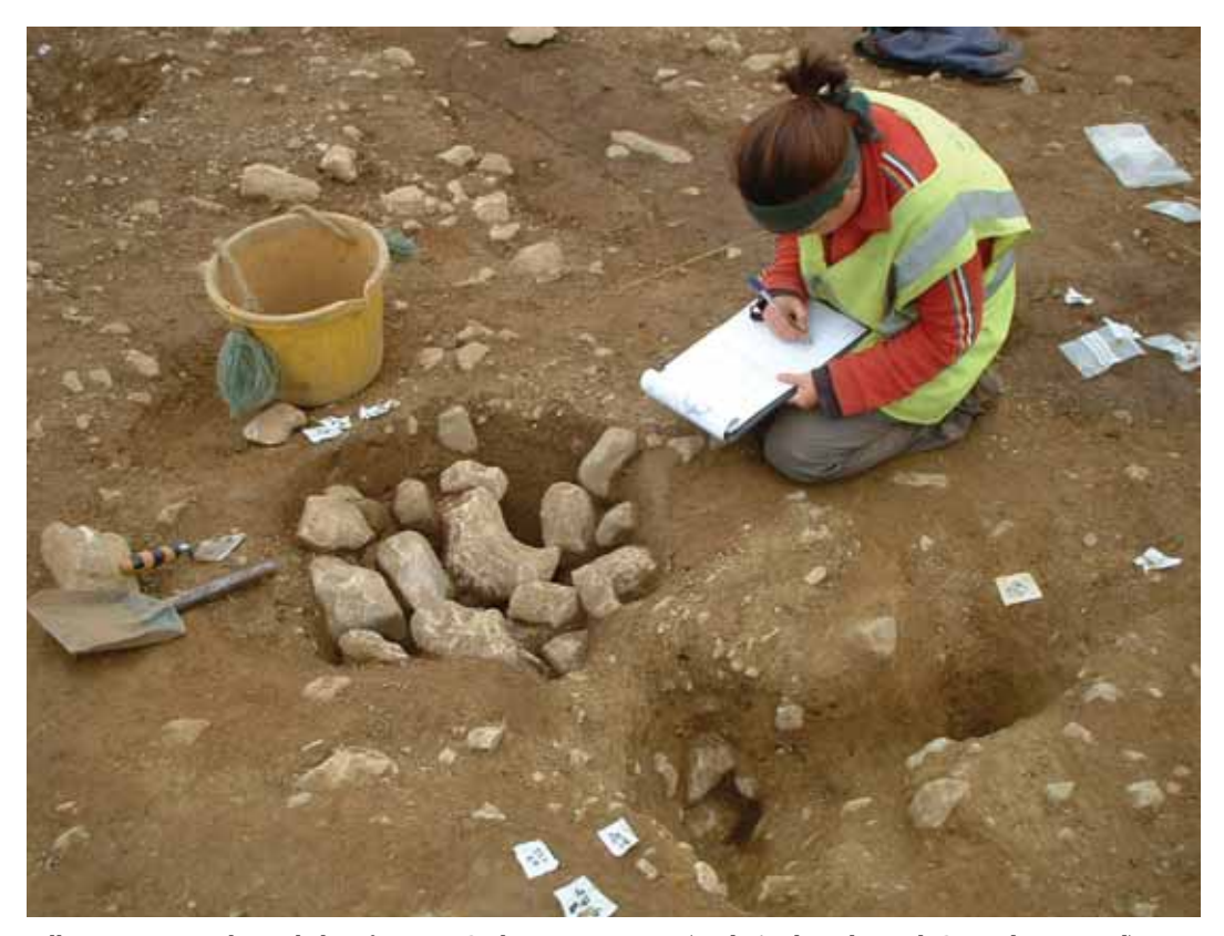
Illus. 9—External post-holes of House C, during excavation (Irish Archaeological Consultancy Ltd)

As these post-holes were quite substantial in relation to the foundation trench (in particular the northern post-holes), it is possible that they supplemented the load-bearing post-holes within the corners of the foundation trench. In addition to this they may have carried much of the roof weight or an overhanging eave.