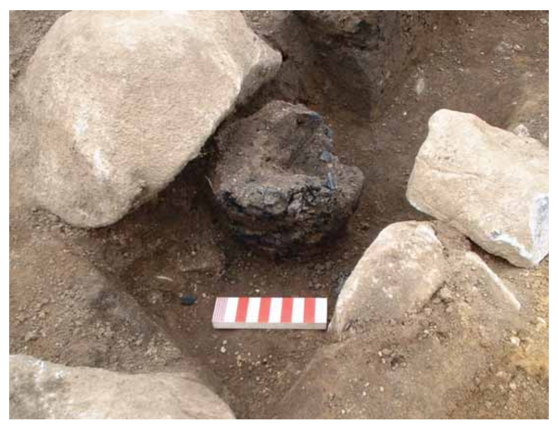
Illus. 8—Burnt post (in situ) in south wall of House C (Irish Archaeological Consultancy Ltd)

post-holes). The internal floor area was 52 \text{ m}^2 . The foundation trench was 0.16-0.37 m deep and, in general, had an irregular profile throughout.