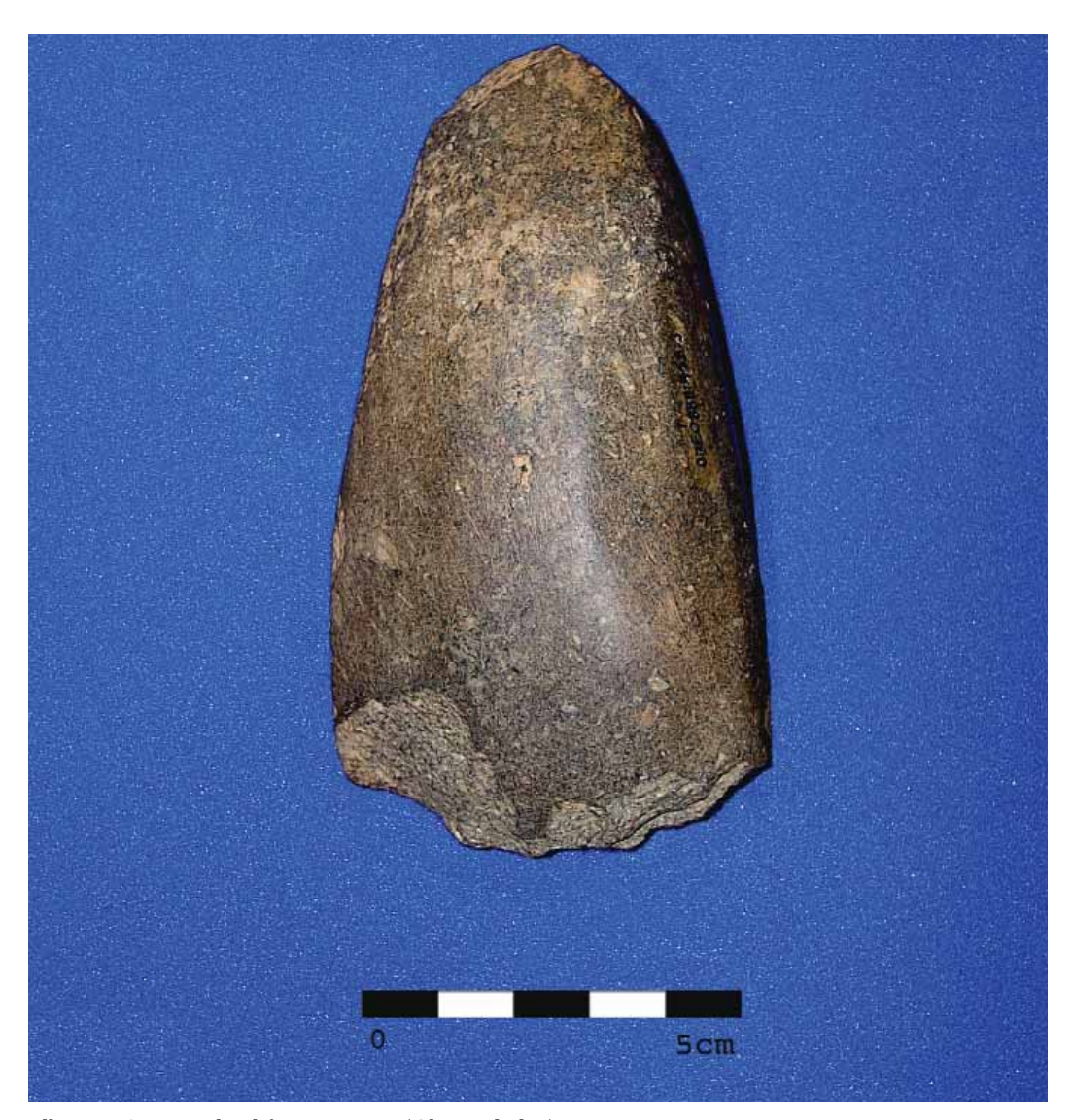
Illus. 6—Stone axehead from House B (Claire Phelan)

stone-packed deposit varied in form from thin lenses of small stone to large clusters of rough stone packing.