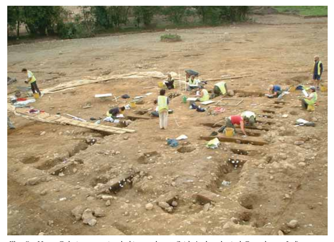
Illus. 7—House C during excavation, looking south-west

House C was the most impressive of the three houses (Illus. 7), as it was sturdier and more architecturally impressive than Houses A and B. The north and south walls would have been flanked by large posts on the exterior of the building, and internal posts would have helped to support the roof. It measured c. 12 m east—west by 7 m (8.5 m including the external