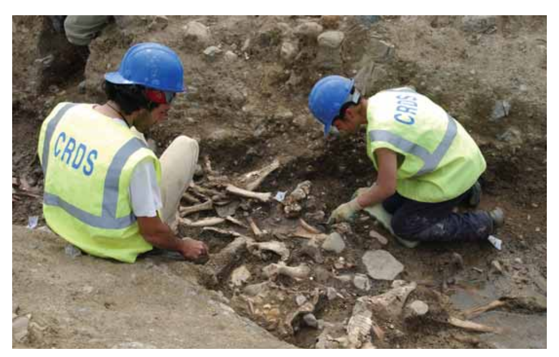
Illus. 5—Animal bone layer undergoing excavation at Kilshane Neolithic henge, Co. Dublin (Hawkeye)

(3200–2800 BC), but it also saw intermittent activity during the Late Neolithic and Early and Middle Bronze Age periods. The enclosing ditch was formed by the excavation of a series of intercutting and overlapping ditch segments. With the exception of some 'cleanedout' cremation pits and a crouched inhumation burial, all thought to have been of Early Bronze Age date, few features were recorded within the interior. A unique element of this site was the recovery of approximately 300 kg of cattle bone from the base of the ditch segments (Illus. 5). Sherds from globular bowls dating from the Middle Neolithic were also discovered in the ditch fills, sealing the animal bone, and these indicate a similar deposition date.