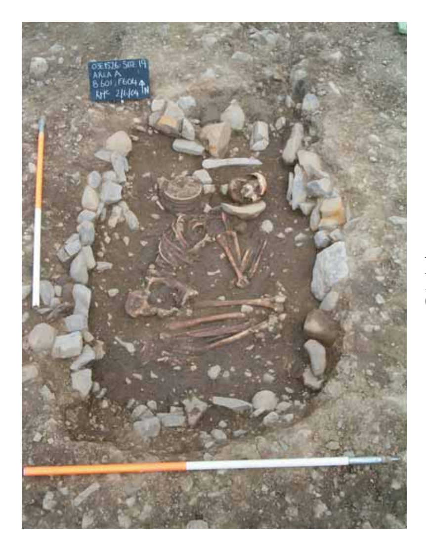
Illus. 7—Burial with Food Vessel pot at Harlockstown, Co. Meath

Moore). One of the pits was lined with a wooden panel, possibly wattlework (radiocarbondated to 1390–1080 BC, Wk-16818), and both may have been accessed by sloping sides laid with fine metalled surfaces. Their purpose is uncertain and they may simply have functioned as wells, as they were deep enough for the extraction of groundwater. An alternative processing function—such as basketry, tanning, dyeing or flax preparation, which all use watery pits—is also possible. Both pits produced organic materials, including worked wood, but one of the pits produced a unique assemblage of 130 basketry artefacts.