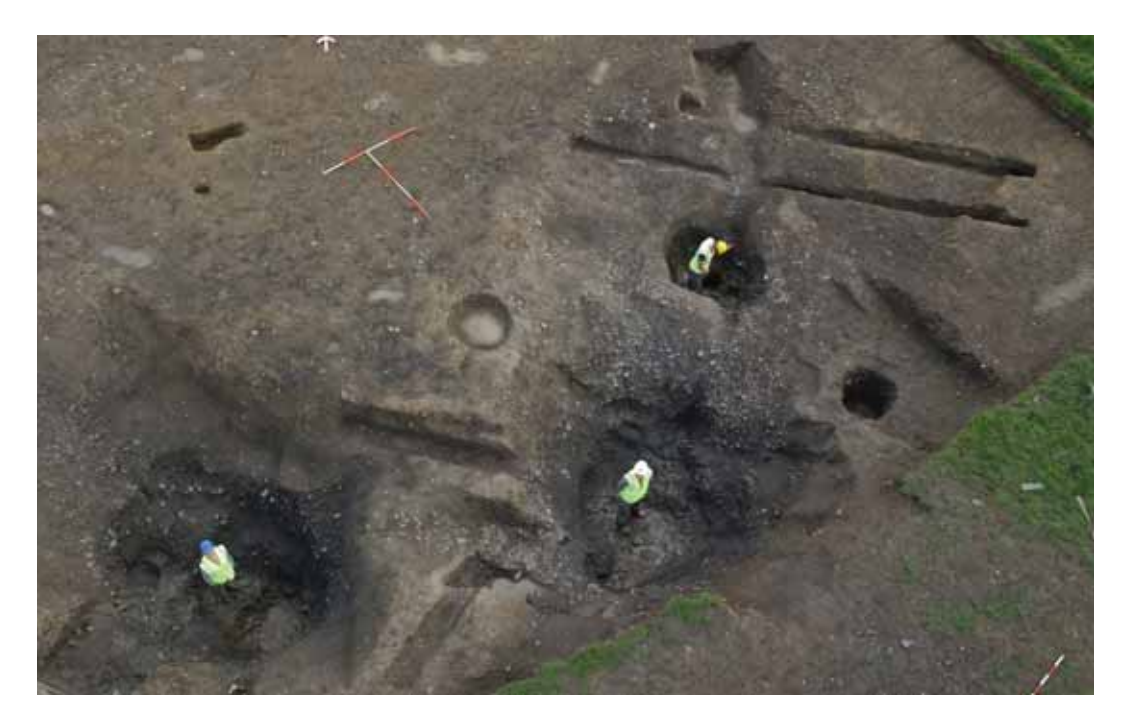
Illus. 2—Overhead view of deep pits or wells at Site 13b, Muckerstown, Co. Meath (Hawkeye)

Many of the other prehistoric sites were of Bronze Age date. These included some very large, deep, waterlogged pits or wells of Middle Bronze Age date (Illus. 2) discovered at Muckerstown (Site 13b), Co. Meath. The pits produced an assemblage of unique wooden artefacts that are discussed in greater detail below.