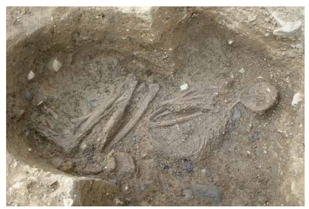
Illus. 10-Female burial with toe-rings, Rath, Co. Meath