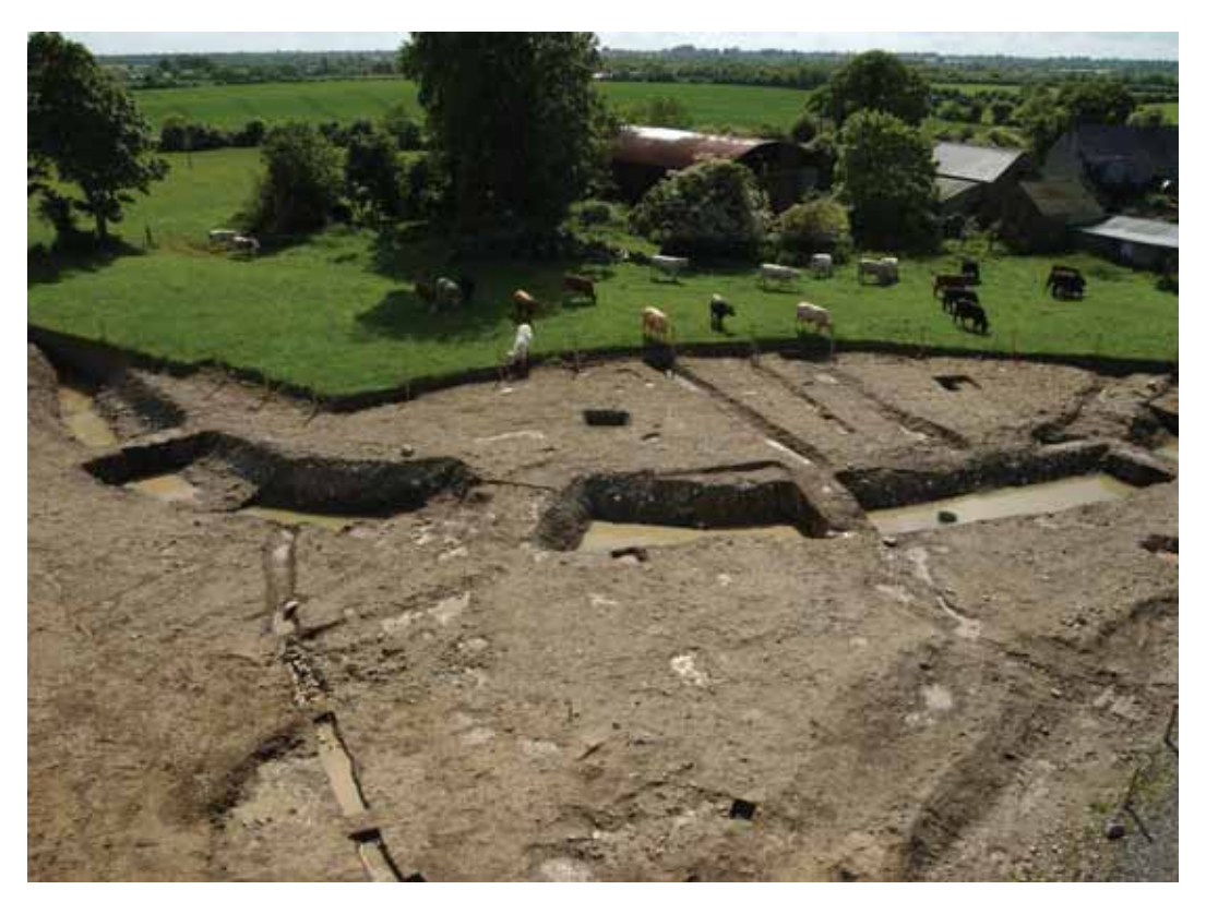
Illus. 3—Segment of ringfort ditch at Cookstown, Co. Meath—an early medieval farmstead enclosure partly underlying a modern farmstead (Hawkeye)

church sites at Donaghmore (ME045-008), Killegland (ME045-004) and Cookstown (ME045-001)). New archaeological sites revealed by the N2 investigations add considerably to this evidence. At the southern end of the scheme, a small, multi-phase cereal-drying kiln and metalworking site (Site 2) was found on a slight rise in the townland of Cherryhound, Co. Dublin. This industrial site had three main phases of activity—a phase of metalworking to the east, followed by phases of kiln activity at the western end of the site. Associated houses and settlements were not discovered but may have been located nearby beyond the road corridor.