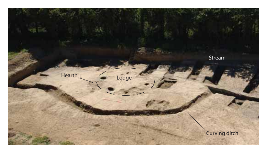
Illus. 9-Sweat-lodge at Rath, Co. Meath: a circle of post-holes within a narrow enclosing ditch (Hawkeye)

The fibula is of late La Tène type and came from the adjacent terrace leading down to the water. Approximately 30 fibulae are known from Ireland. Preliminary examination of this new fibula indicates that the type is unique in Ireland and is paralleled only by British finds (B Raftery, pers. comm.). The introduction of the fibula brooch to Ireland during the Iron Age is thought to reflect changes in clothing such as the wearing of finer wool and linen garments.