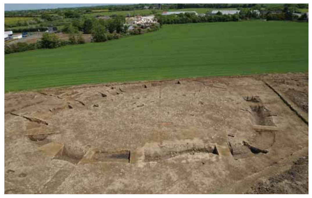
Illus. 4—Elevated view of irregular henge enclosure at Kilshane, Co. Dublin

The earliest and one of the most significant sites from the scheme was a Neolithic ritual enclosure (Illus. 4), 37 m by 27 m, discovered at the southern end of the scheme at Kilshane, Co. Dublin (NGR 311010, 242951; height 81.3 m OD; excavation licence no. 03E1359 extension; Excavation Director Dermot Moore). The artefactual evidence from pottery and stone tools indicates that this site had its origins in the Middle Neolithic period