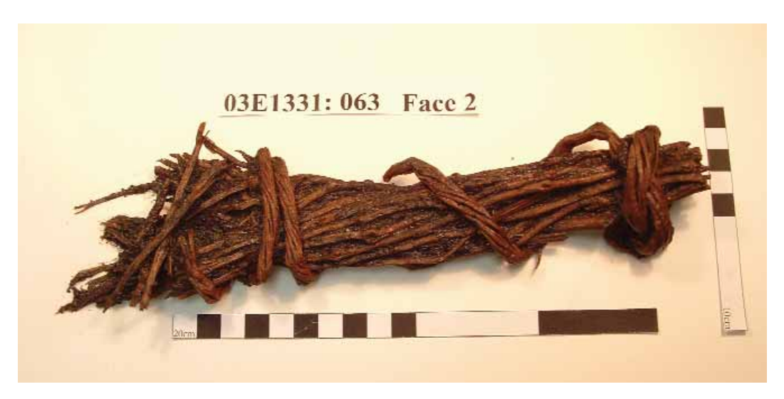
Illus. 8-Wooden basketry artefact from Site 13b, Muckerstown, Co. Meath (CRDS Ltd)

artefacts in watery locations is well attested in prehistoric times and the objects may therefore have had a non-functional, symbolic significance (C Moore, pers. comm.).