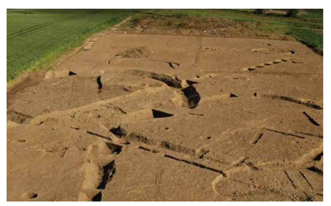
Illus. 6—Elevated view of prehistoric complex at Harlockstown, Co. Meath, showing Early Bronze Age circular enclosure (left) and square Iron Age enclosure (right) (Studio Lab)

to 1960–1690 BC, Wk-16288; see Appendix 1 for details) cut by a square Iron Age enclosure where extensive metalworking activity took place. Excavation revealed that the circular enclosure was a burial monument with a cremation pit and two inhumations within the interior. There was no evidence for a mound, but the upcast material from the ditch may have been thrown into the enclosure and the burials inserted into the mound material.