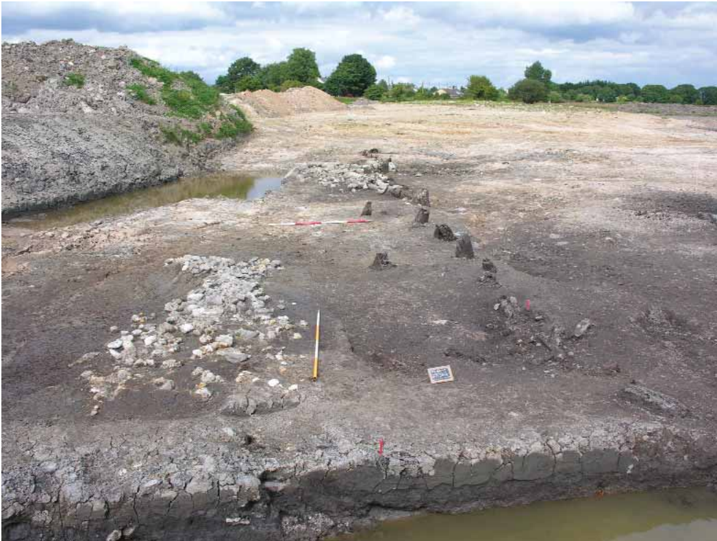
Illus. 5—Bronze Age post row and trackway (TVAS [Ireland] Ltd)