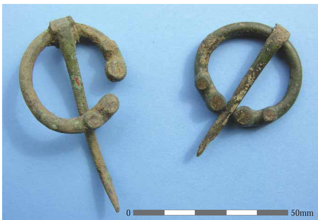
Illus. 6—Two penannular ring-brooches, of sixth/seventh-century AD date, which were recovered from the enclosure ditch

alluvium, demonstrating its later date. The discontinuous trackway extended for almost 67 m and may have led to the same stream that was accessed during the prehistoric phase of occupation.