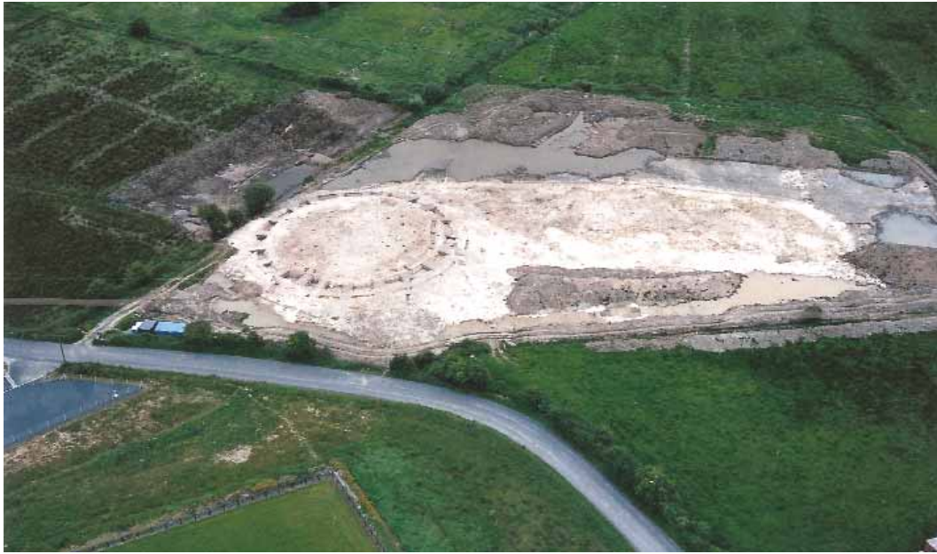
Illus. 3—Aerial view of the site from the north

archaeological instincts proved to be correct: test trenches targeted across the mound revealed evidence of a substantial ditch, indicating a circular enclosure surrounding the mound. A few small possible pits were also located within the enclosure, and a number of other features were found elsewhere in the field. As a result, the site was fully excavated in the summer of 2005.