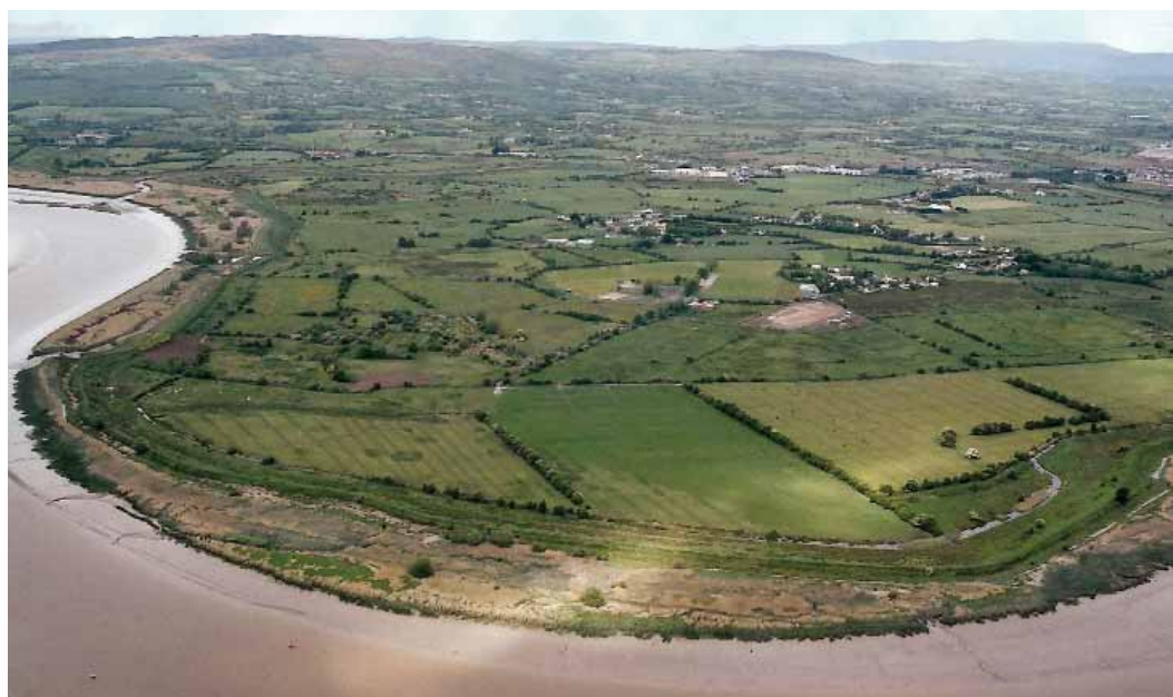
Illus. 2—Aerial view of Coonagh West from the south; the site is visible as a soil-stripped area to the right

The Geological Survey of Ireland (Lamplugh et al. 1907, 58), for example, notes that the ‘continuity of the deposit [the alluvium] is broken only in the Coonagh district by a slightly elevated tract of rock and boulder clay, which forms, as it were, an island in the alluvium’. The archaeological site lies on a low ridge on the edge of this island, bounding deeper alluvial deposits.