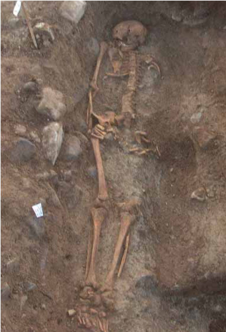
Illus. 5—Inhumation burial showing skeleton disturbed by the digging of Ring-ditch 1

An inhumation burial (Burial 5) and a post-hole both pre-date the digging of Ring-ditch 1. The post-hole was c. 2–3 m NNE of the burial; its function is not known, although its dimensions were large enough to have supported a substantial marker. Documentary evidence confirms the practice of placing crosses on burial sites during the early medieval period (O'Brien, forthcoming) and this practice may have been the source of the present townland name, Cross ( Crois ). Joyce (1923, 327) states that there are 30 such townland names in Ireland and that a further 150 placenames use 'Cross' as a prefix. In Joyce's opinion, many refer to a crossroads, but others are so named for the location of an actual cross on the site. O'Brien (forthcoming) refers to an incident recorded by both Muirchú and Tirechán in the seventh century. This relates how St Patrick encountered two graves, one of which was marked by a cross. A pagan was buried in one grave and a Christian in the other—hence the cross, to distinguish them. Although this does not confirm the practice to be contemporary with Patrick, it does substantiate familiarity with the practice in the seventh century.