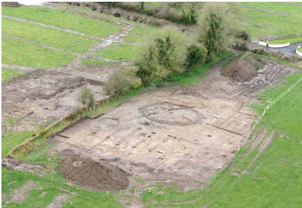
Illus. 3—Elevated view of the burial-ground at Cross, looking west (Hany Mazouk)