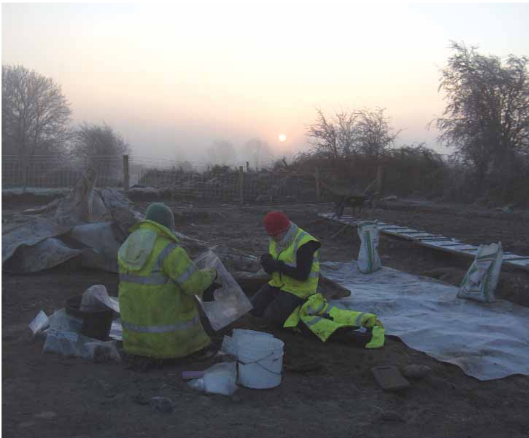
Illus. 6—Excavation of Burial 4

Burial 1 was centrally located within Ring-ditch 2. It was the skeleton of a child aged about 2.5 years, aligned west–east, and it lay in a roughly stone-lined grave. Small stones in the