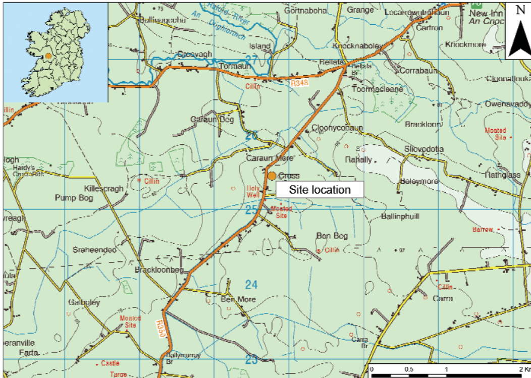
Illus. 1—Location of Cross, Co. Galway (based on the Ordnance Survey Ireland map)

The discovery of a previously undocumented burial-ground attracts human interest. We feel a certain sensitivity among the surroundings, unfortunately all too often from some deep-rooted memory of our own attendance at the funerals of family or friends. Deep within ourselves we realise that we too, in some form, will come to rest in a similar environment. The nature of that final rest will depend on the culture of the community and of the society in which we have lived. Modern culture allows us to choose how we are disposed of following death—the new emphasis being on ‘disposal’. Until recently it was more important that the deceased be buried in the community burial-ground and repose there awaiting the day of judgement, following which the faithful of the community would be reunited.