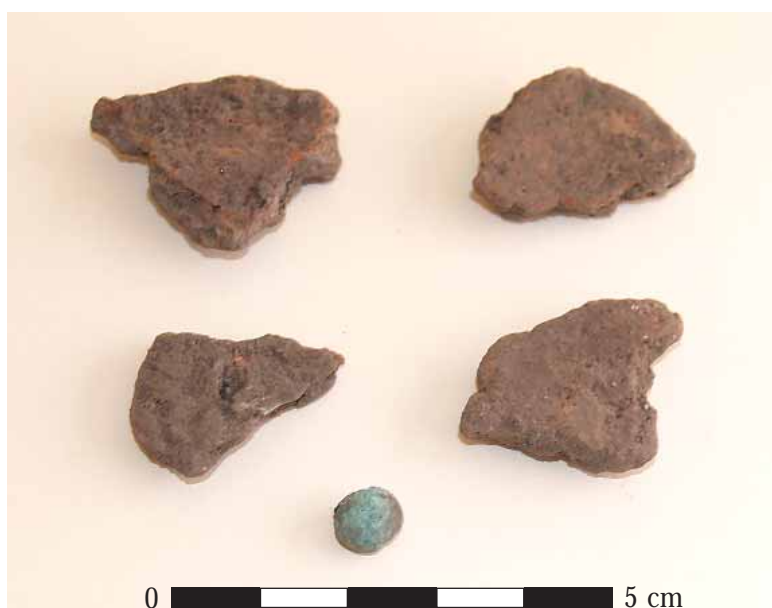
Illus. 4—Pottery sherds and copper-alloy artefact recovered from token cremation burial (Gerry Mullins)

The rite of cremation burial was widely used throughout the Bronze Age. Many of these cremation pits were isolated and it is not uncommon to note an absence of grave-goods and large bone fragments. Deposition of a token bone sample is common to many cremations during this period, and indeed several barrow excavations have produced no burial evidence (Grogan 2005, 66–7, 184). Cremation was also the predominant burial rite during the later centuries BC and the early centuries AD. During this period cremation burials were sometimes deposited directly into the ground, unaccompanied by grave-goods (O'Brien, forthcoming). Cremation burial continued to be practised by some in Ireland until the fifth or sixth century AD, an example being Furness, Co. Kildare ( ibid. , 3). During the summer of 2005 the excavation of a ring-barrow cemetery at Ask, Co. Wexford, produced a cremated burial dated by an associated artefact to the eighth century AD (Stevens, this volume).