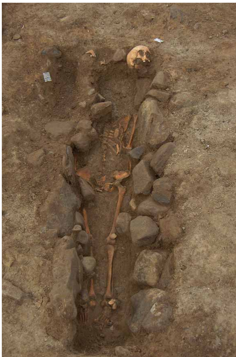
Illus. 7—Burial 4, disturbed by the cutting of a later pit adjacent to the skull

area of the skull had possibly been used as a pillow. The shallow grave was truncated on the eastern side by past agricultural activities. Some white quartz pebbles were found within the grave fill but no artefacts were recovered.