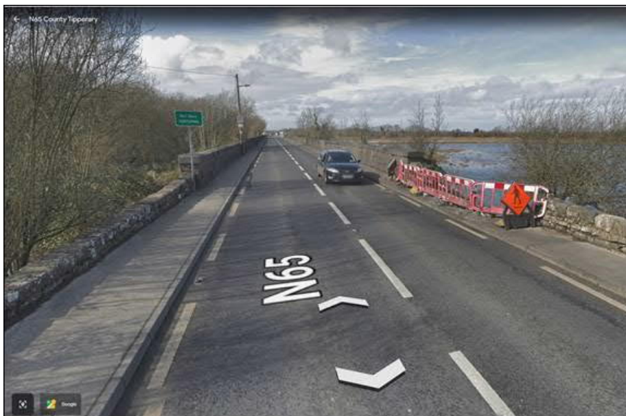
Plate 1. View of Portumna Wall.