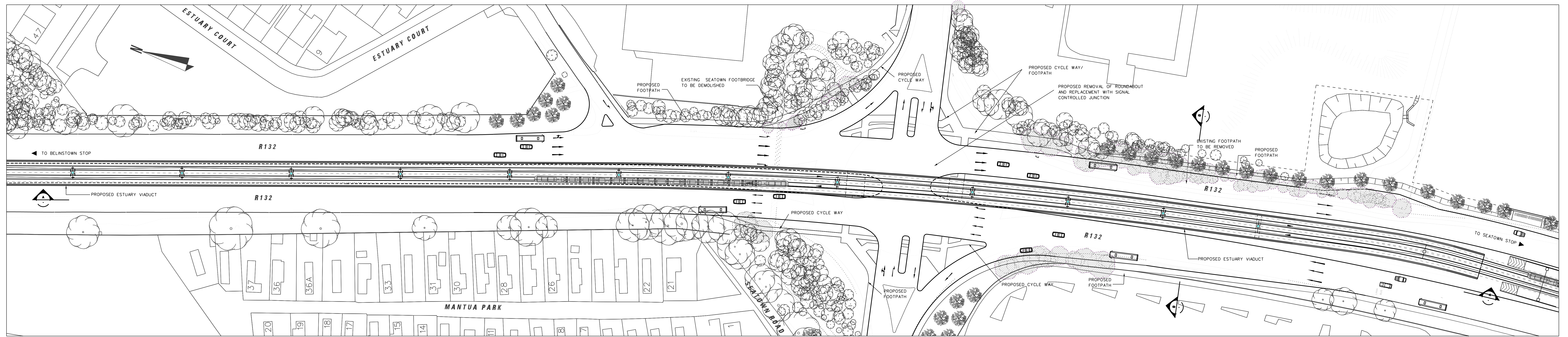
PLAN SCALE 1:500