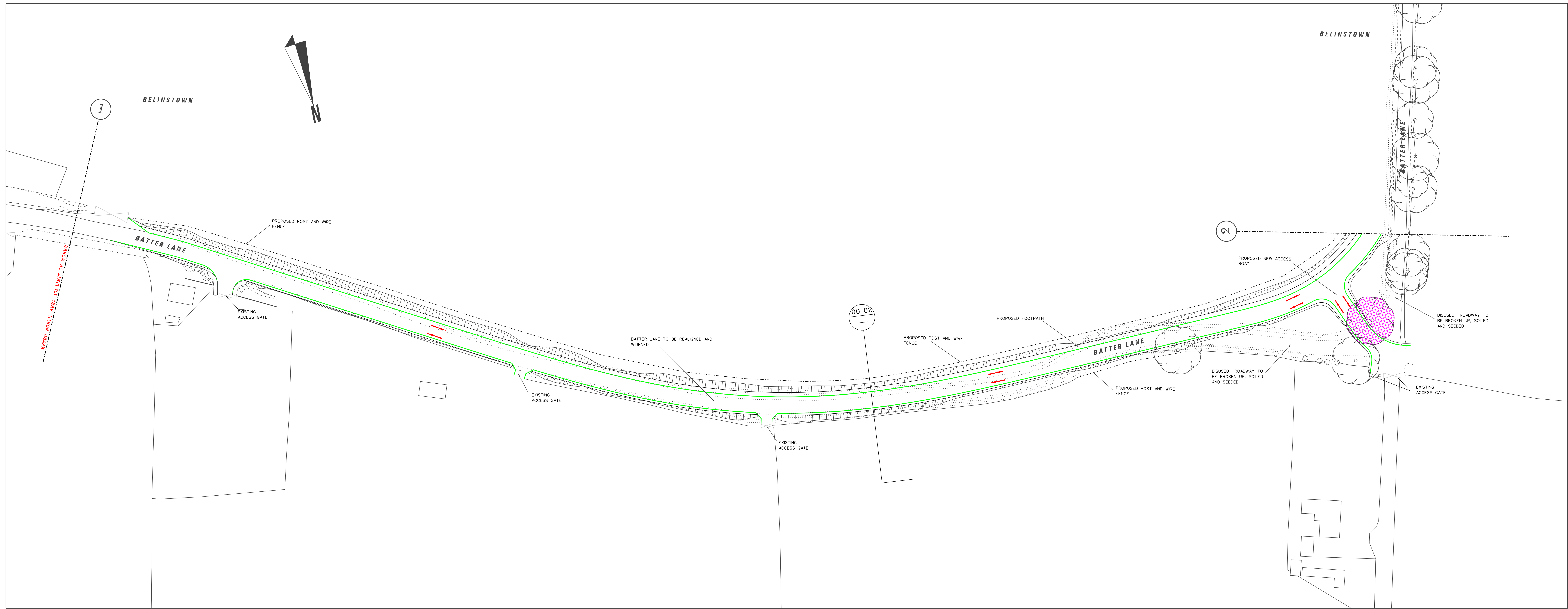
PLAN SCALE 1:500