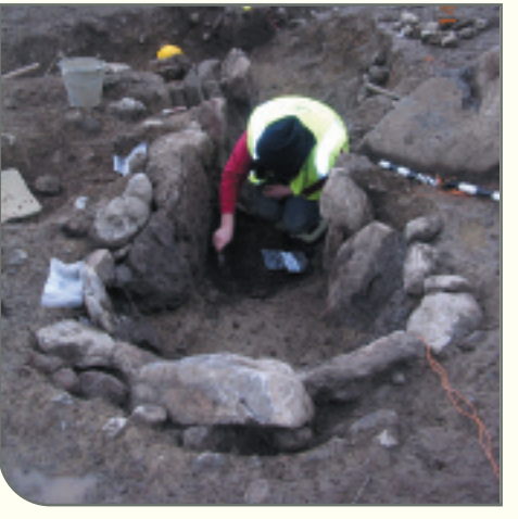
Archaeologist excavating kiln uncovered at Clonfad.

What kind of metalworking went on? Well, the site yielded unique evidence of the production of wrought iron handbells. Fragments of vitrified clay have been identified by a specialist as coating from brazing of type I wrought iron handbells.