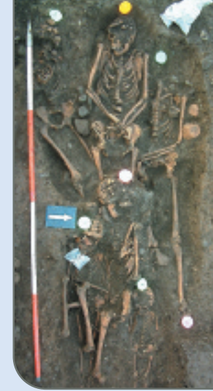
Multiple burial cluster uncovered during excavations at Ballykilmore.