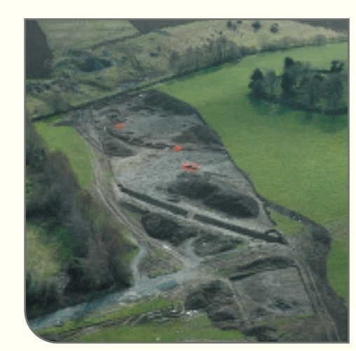
Aerial view of Clonfad enclosure with the church and graveyard in the background.