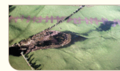
Aerial view of centreline test trenching carried out on the scheme.