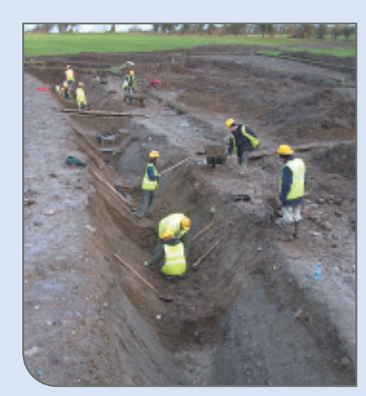
Archaeologists excavating the outer enclosing ditch at Clonfad.

A range of industrial activities were carried out there, with significant evidence of iron smithing, fine bronze metalworking, bone/antler comb and button/bead manufacture and textile working.