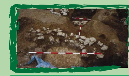
Excavation at Ballymount