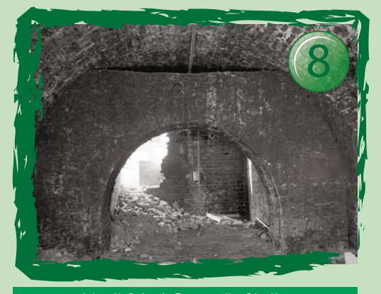
Vault 14 at Connolly Station

In conjunction with pre-construction testing, archaeological investigations and excavations, a detailed architectural survey was carried out on all buildings impacted by the works. One of the most interesting areas surveyed was under the present day ramp for vehicles located at Connolly Station. The interior of this ramp consisted of a series of interconnecting vaults. Vault 14 shows the fine workmanship and care with which these vaults were constructed (See photo Number 8).