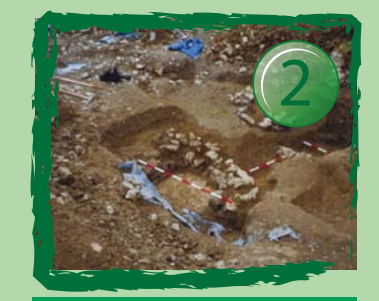
Souterrain at Ballymount