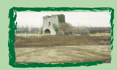
Site clearance at Ballymount

There were no main archaeological sites revealed on this route. But routine monitoring revealed such features as stone culverts, post-medieval refuse pits, basements and coal cellars associated with 18th/19th century houses.