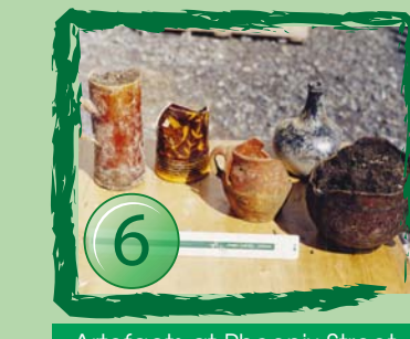
Artefacts at Phoenix Street