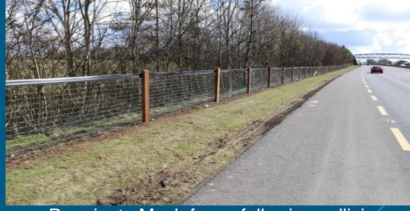
Repairs to Mesh fence following collision