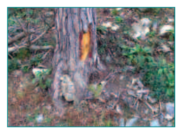
Scots pine showing damage to the trunk from construction works

The bark of a tree forms a protective layer around the conducting tissues located immediately beneath.