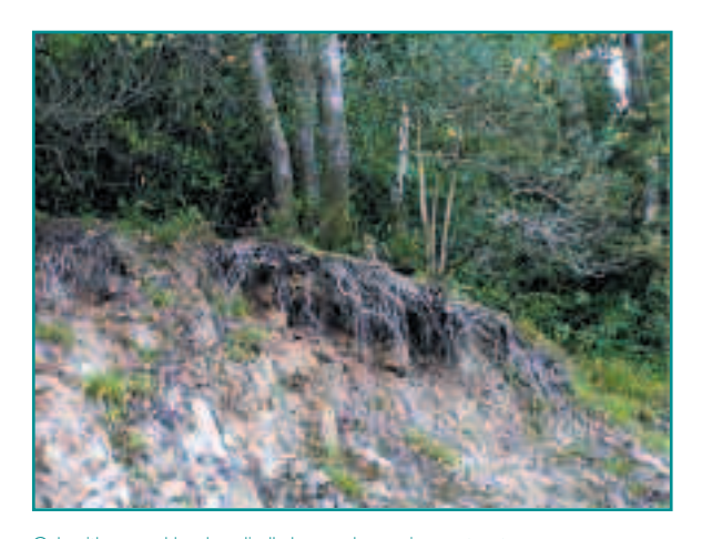
Oak with ground levels radically lowered exposing root system.

Increasing bulk density by one third can be expected to cost a tree one-half of its root and shoot growth.