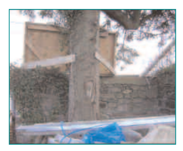
Tree displaying bark damage as a result of no protection. Possible entry point for pathogens.