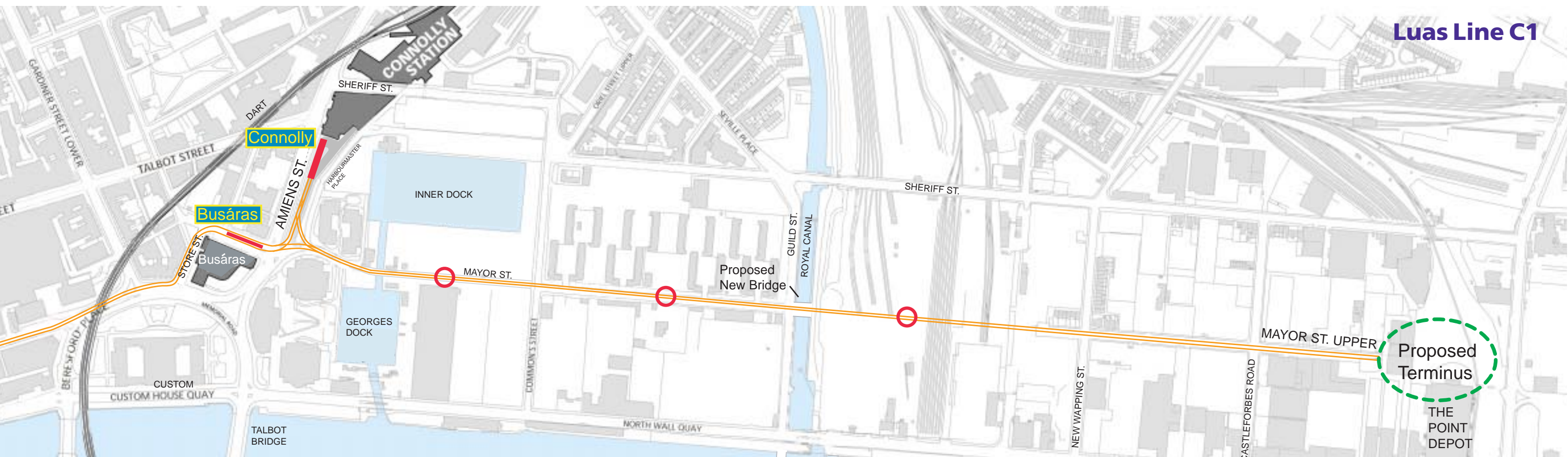
Luas Line C1

Copies of this EIS can be purchased for a sum of €15.00 each; A CD version of the EIS can be purchased for a sum of €5.00; Copies of the Non Technical Summary of this EIS may be purchased for a sum of €3.00 each at the above locations.