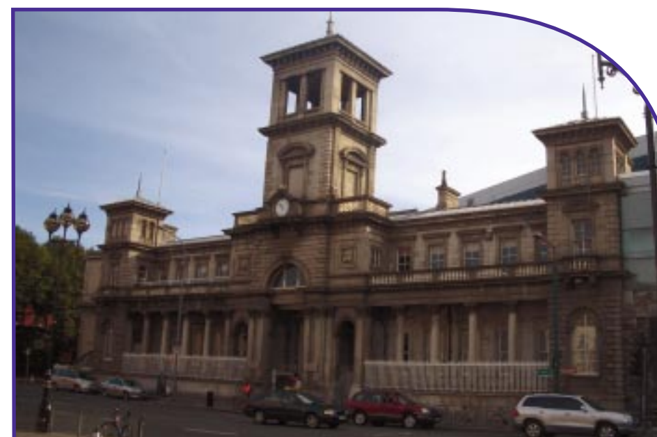
Connolly Station (front)

There are no predicted operation impacts associated with cultural heritage other than the appearance of wires (and their associated fixings) on a number of buildings which is considered a marginal impact.