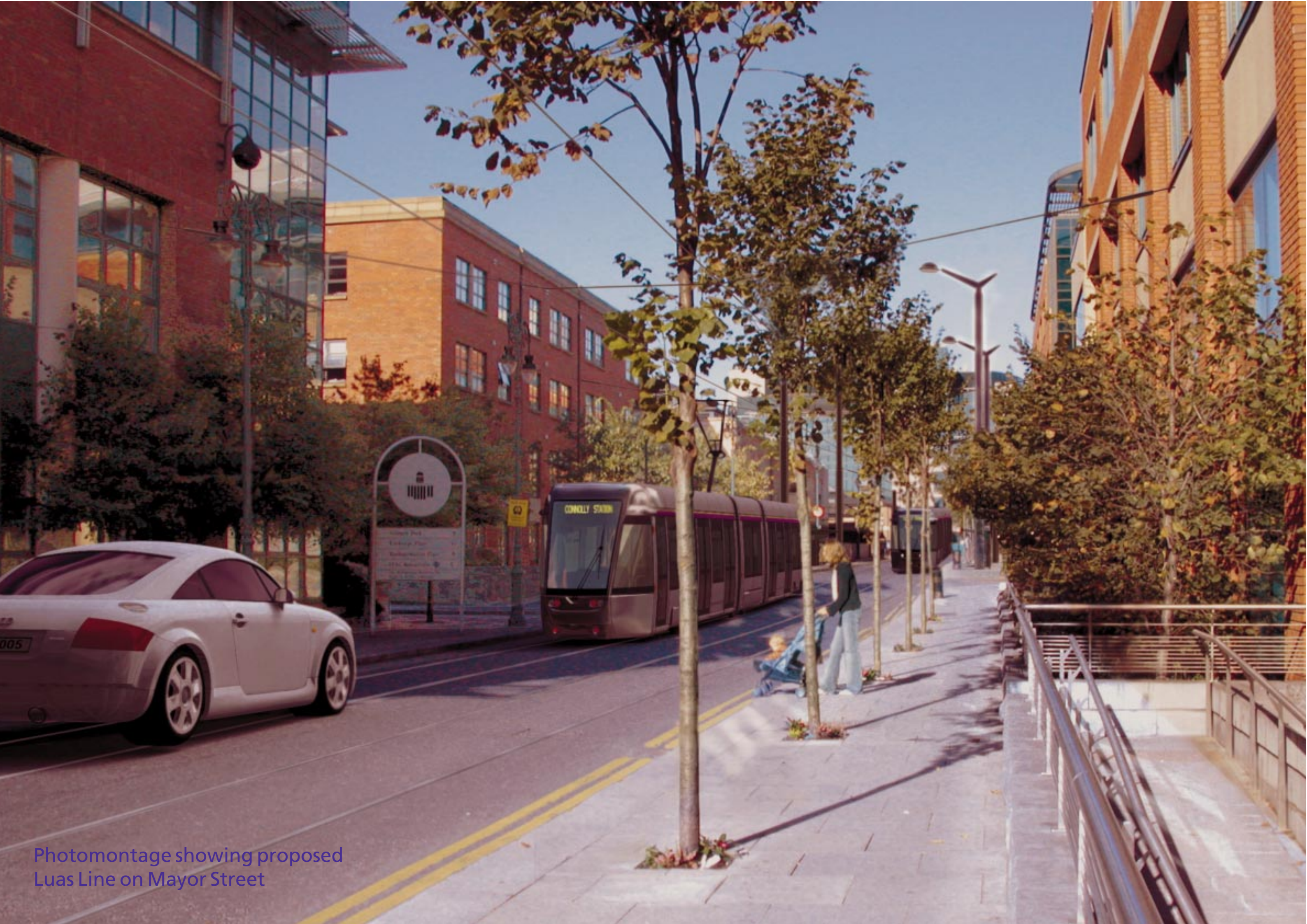
Photomontage showing proposed Luas Line on Mayor Street