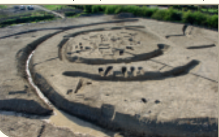
Elevated view of Collierstown post-excavation.

Preliminary analysis indicates that a site at Collierstown, excavated by ACS Ltd, developed from an Iron Age ring-ditch, incorporating a number of human burials and possibly cremations, into an early