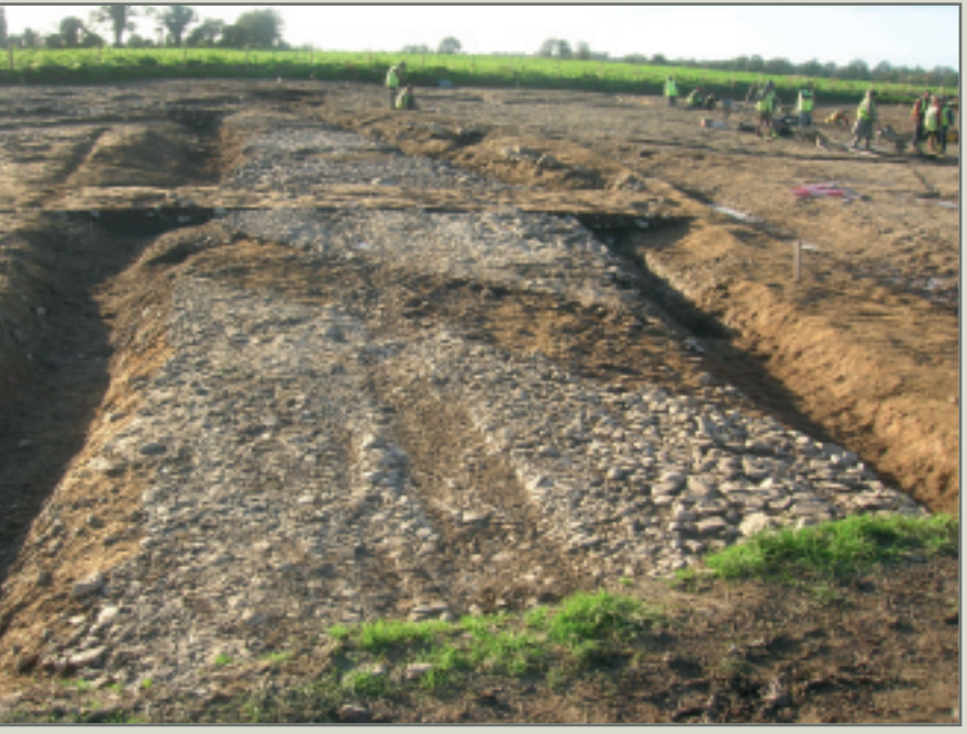
Medieval road at Phoenixtown mid-excavation.

A number of cereal-drying kilns and a possible animalpowered mill were uncovered adjacent to the road. A large amount of 13th-century pottery was recovered on site, suggesting an associated settlement nearby. Historical research into the Anglo-Norman families who held this land is ongoing and so far has It had a well-worn surface with wheel ruts from carts produced tantalising references to the supply of grain by these families to the King of England.