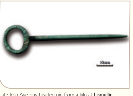
Late Iron Age ring-headed pin from a kiln at Lismullin.

Archaeological, historical and palaeoenvironmental research and specialist analysis is ongoing in preparation for detailed publication of the full results. In the meantime updates on this work are presented on a dedicated website: www.m3motorway.ie