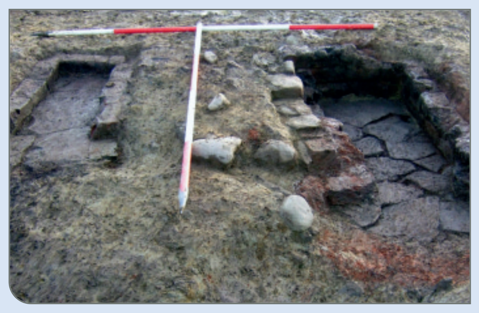
Kiln or possible poitín still at Phoenixtown 4 post-excavation.

A curious early 19th-century site found at Phoenixtown and excavated by IAC Ltd has been tentatively identified as a kiln or possible poitín still. Fragments of glass tubing were recovered from the two open-air rectangular kilns or fireplaces built of red brick with stone flag bases.