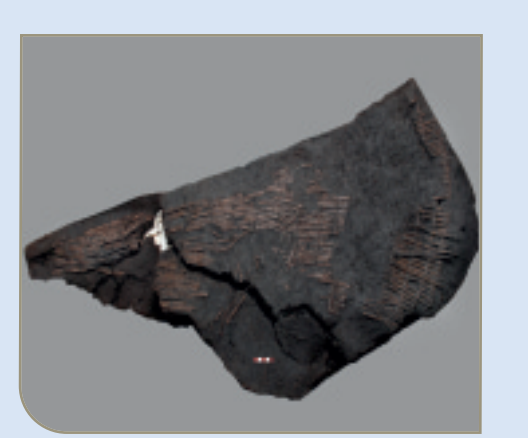
Mesolithic fish basket from Clowanstown.

Four finds of well-preserved conical fishing baskets made from thin stems of alder, birch and rosaceae have been radiocarbon-dated to approximately 5000 BC . Later activity on the site included burnt mounds dated to the Neolithic period with finds of polished stone axeheads, leaf-shaped projectile points, scrapers and polished stone pendants.