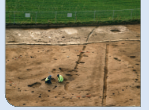
Inner enclosure post-ring at Lismullin mid-excavation.

A number of phases of archaeological activity dating from the Early Neolithic to the early medieval period were uncovered at Lismullin by ACS Ltd. In the early Iron Age (sixth to fourth century BC) a large circular enclosure formed of numerous widely spaced narrow posts was constructed. There were three elements to the enclosure: an outer enclosure comprising a concentric double ring of posts, 80 m in diameter; a central inner enclosure of a single ring of posts, 16 m in diameter, and an east-facing entrance way which comprised of an avenue of widely spaced posts.