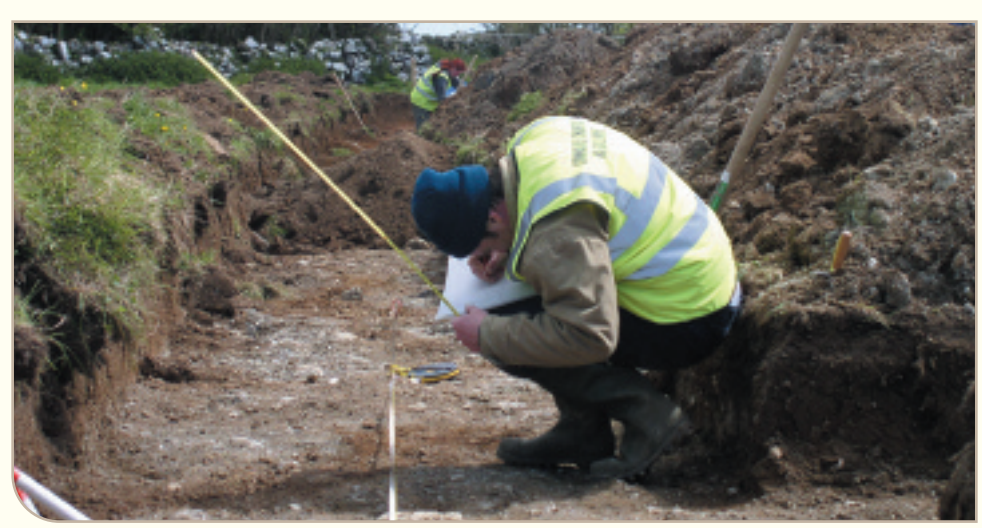
Archaeologists from Galway County Council examine features exposed in machine-cut test trenches in pasture.

At the outset, early maps and aerial photographs were examined and the route was inspected in the field by a 'walkover' survey. Also, a geophysical survey aimed to discover any buried features that could not be seen by surface inspection alone. Following this, archaeological test-trenches were opened in every field by mechanical excavators working under archaeological supervision. Arising from all this, new archaeological sites were discovered at three locations and were excavated by a team from Galway County Council. The three new sites were in the townlands of Tullagh Upper, Fairfield and Greeneenagh.