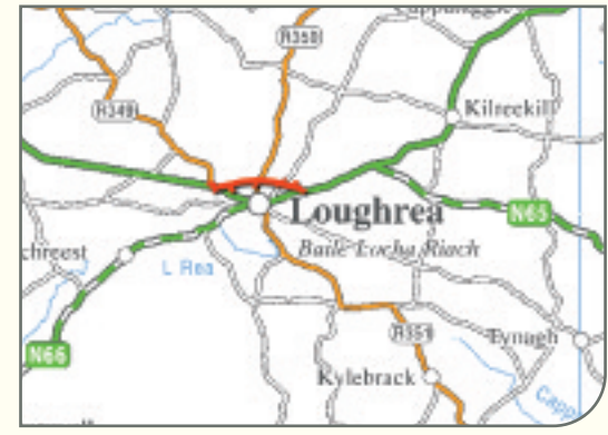
© Ordnance Survey Ireland & Government of Ireland permit number 8067.