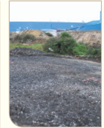
indicates a Bronze Age campsite or cooking place in a narrow stream valley in Greeneenagh.