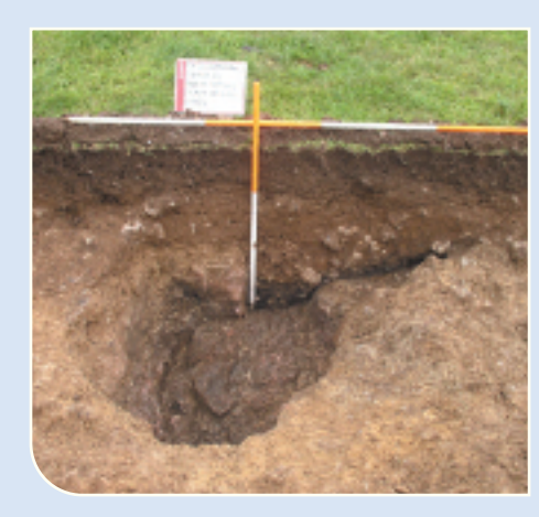
An earthcut 'field oven' in Fairfield contained wood charcoals and deer antler:

Excavation discovered a small pit cut deep into the subsoil and the underlying rock. The sides were scorched and the pit contained wood charcoals and fragments of deer antler. A radiocarbon date for the antler is awaited and until this is known it is not otherwise possible to say how old this pit may have been, but it may have been an improvised medieval field oven.