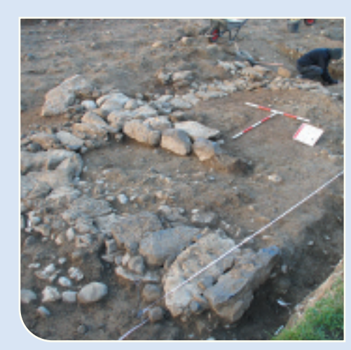
Close up view of the remains of an 18th-century house under excavation at Tullagh Upper .

Loughrea has a long history. When the Normans invaded the west of Ireland in the early 13th-century Richard de Burgo established a town by the lake and made it the capital of his Lordship of Connaught. His castle is long gone but the town ditch can still be seen and there is a later medieval gate arch at the east end of Barrack Street.