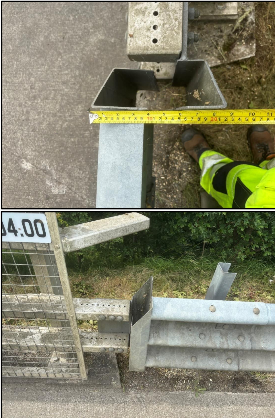
Plate 1 Broken VRS steel connection on the northwestern parapet.