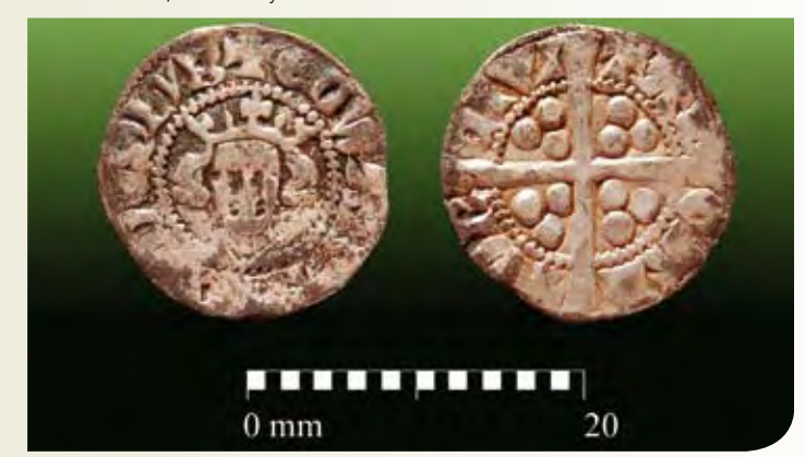
Fig. 4: English silver 'long cross' penny of Edward I or II, minted in Canterbury sometime after AD 1302. This coin has been clipped around the edges, an illegal practice that incurred very heavy penalties. Found within grave deposits at Ballyhanna.