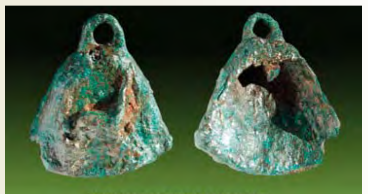
Fig. 3: Medieval copper-alloy bell from Ballyhanna. The bell was probably made locally but was miscast; it is unlikely that it was ever used.