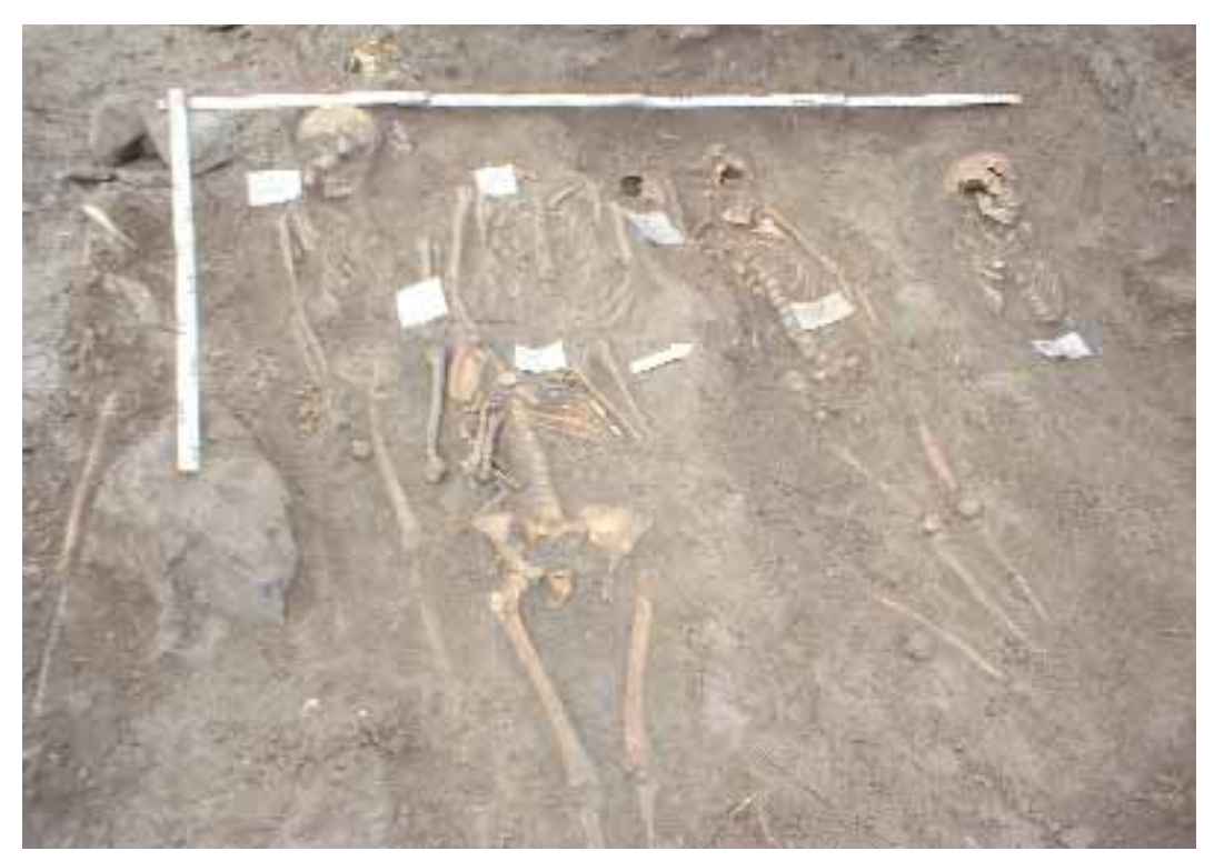
Illus. 3—Some of the 1,275 skeletons from the medieval cemetery excavated at Ballyhanna.