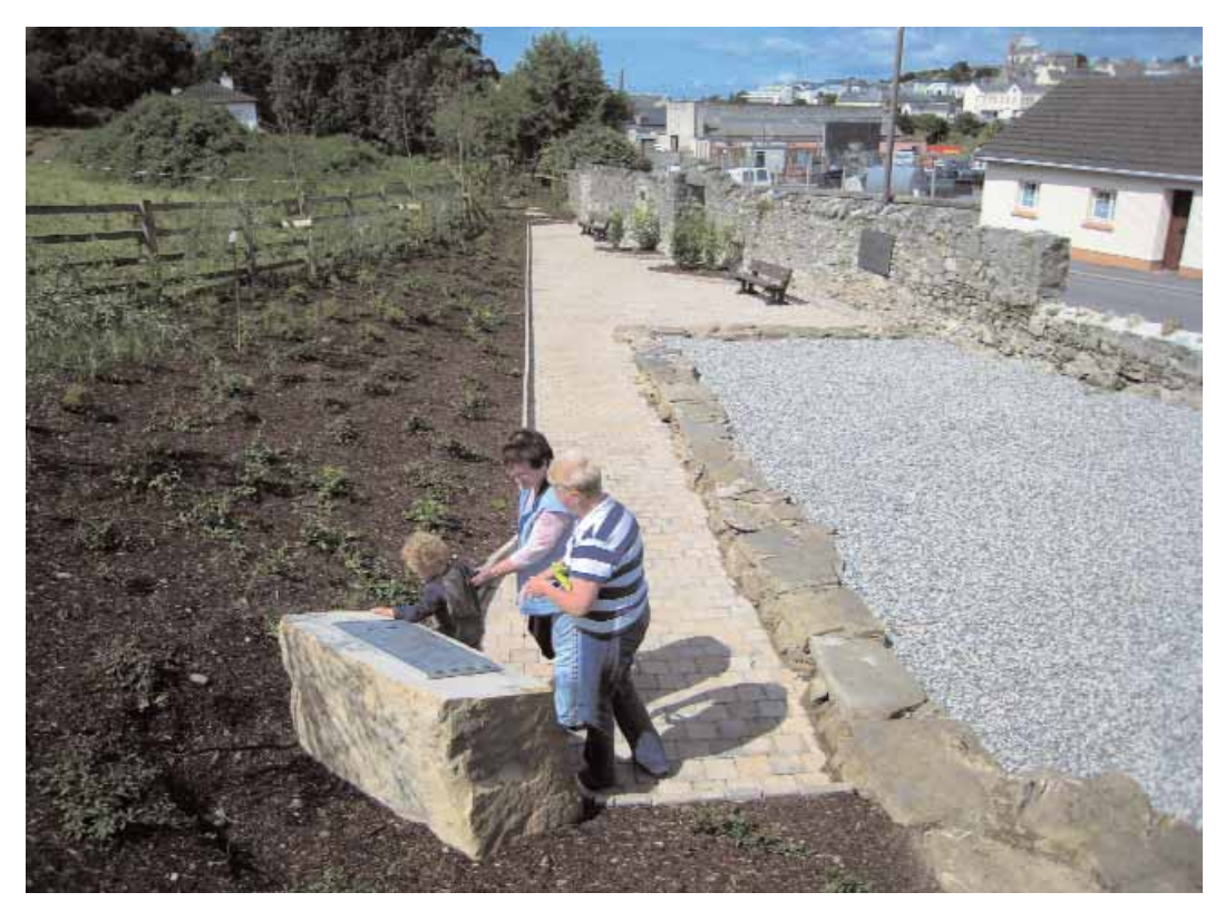
Illus. 4—Site of Ballyhanna church and cemetery, which was officially opened on 15 July 2007 as part of the 'Flight of the Earls' commemorations in Donegal.