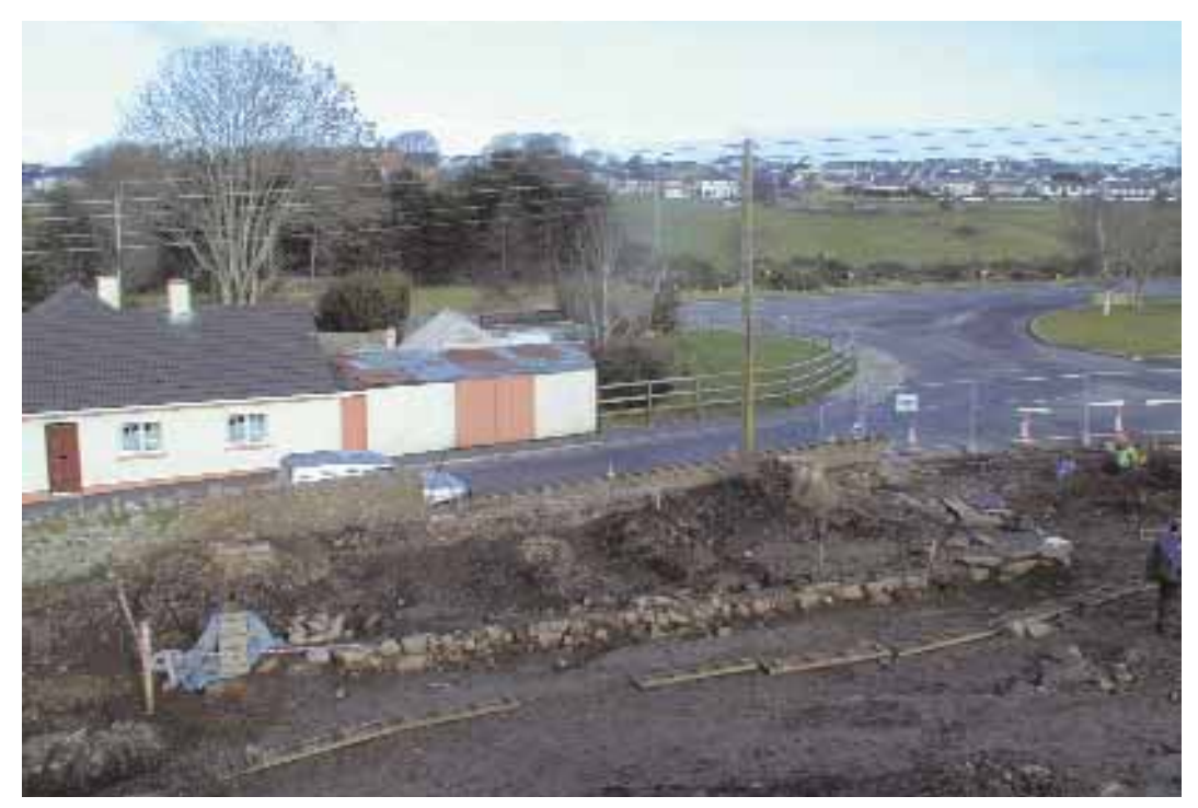
Illus. 2—Ballyhanna church during excavation, February 2004 (Michael MacDonagh).

church at Ballyhanna were spirited away across oceans and into mass graves—that is, until it was rediscovered in June 2003.