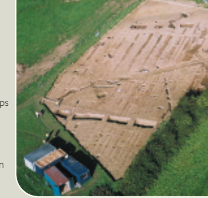
Aerial view of early medieval settlement uncovered at Killickaweeney .

This site was subdivided into separate distinct areas, occupation in the west, an industrial area to the north and a habitation (living) area to the south of the enclosure; whilst the east is considered to have been used predominantly for livestock.