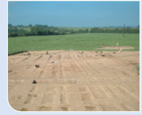
Archaeologists excavating the early medieval site uncovered at Killickaweeney .

The excavations at Killickaweeney have given an insight into how people lived between the 8th and 10th-century AD. It portrays a small self-sufficient community, which had the ability to produce its own tools, textiles and food supply. The production of fine metal objects by the smith was likely to have enhanced the status of the settlement.