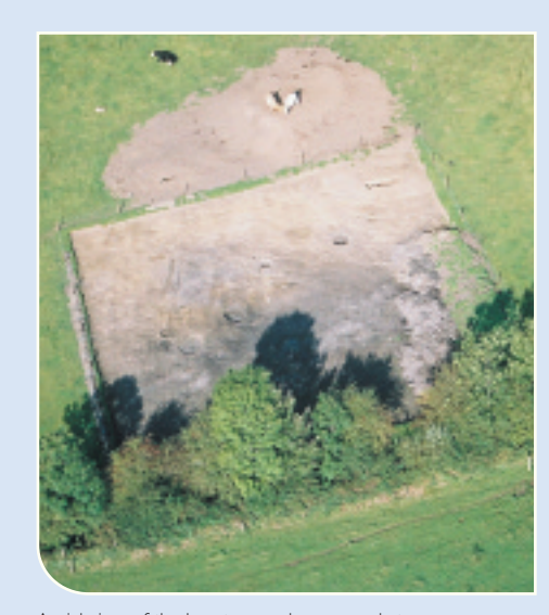
Aerial view of the burnt mound uncovered at Kilmorebrannagh.