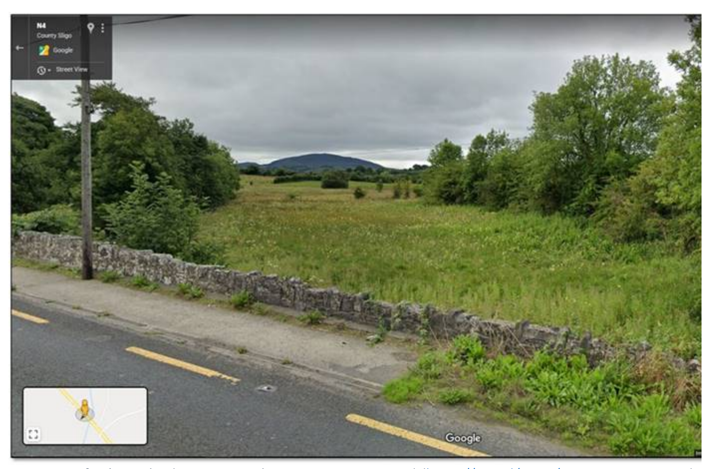
Upstream of Behy Bridge (Source: Google Street view Aug 2018) (https://goo.gl/maps/ZEUppsSoE8rxS6vg9).

It should be noted from google street view imagery (see below) that the field upstream of the bridge on the left bank (looking downstream) appears to be colonised by a range of wetland species such as Meadowsweet ( Filipendula ulmaria ), willowherbs ( Epilobium sp.) etc. This habitat could potentially correspond to, or include elements of, wetland habitats such as Marsh (GM1), Tall-herb swamps (FS2) or fen (PF). Correspondence with EU Habitats Directive Annex I habitats such as 6430 Hydrophilous tall herb (or [6410] Molinia meadows. No access to this area is permitted.