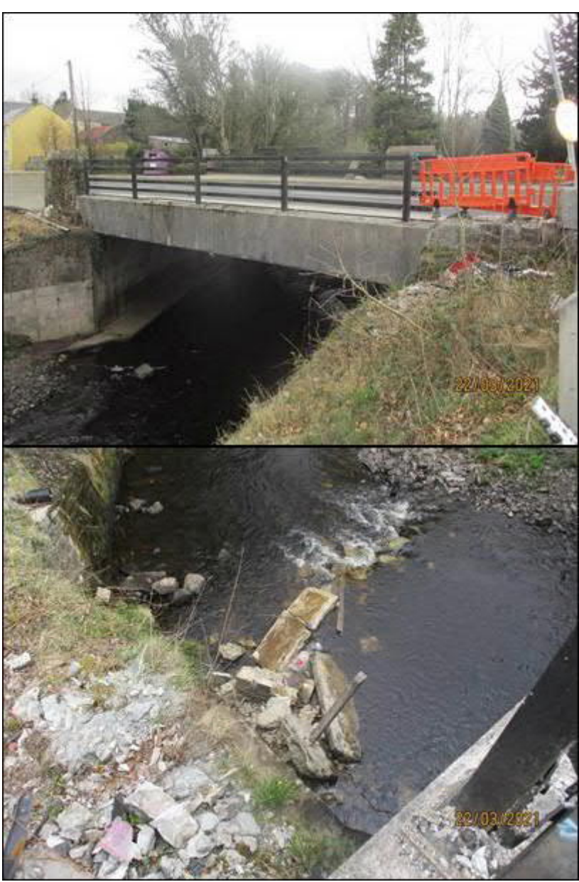
Plate 1 Works Area (left) and bridge debris in the river (right).

Lough Fern SPA (004060) is located ca. 3.5km d/s of bridge. The qualifying interests are: - Pochard (Aythya ferina) [A059] and Wetland and Waterbirds [A999]. The SPA is too remote from the proposed works area to be either directly or indirectly affected by the works.