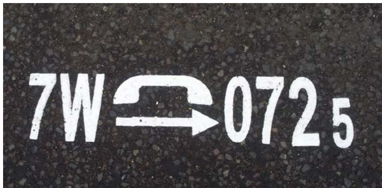
Figure 2 : Location Reference Marking

Location Reference Markers (LRMs) supplement the LRI signs. Location reference Markers are painted in the hard shoulder parallel to the road. The LRM indicates the route and the direction of travel along with distance from the start of the route. In addition the LRMs indicate the direction to the nearest emergency telephone. An example LRM is indicated in Figure 2 below. LRMs are painted in the hard shoulder every 100 metres.