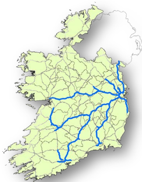
Figure 2 : LRI/LRM location

LRI signs and LRM markings will typically appear on motorway/dual carriageway sections of the national road network, as outlined in Figure 2.