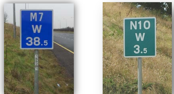
Figure 1 : LRI Signs

LRI signs are located on the nearside verge and are typically spaced every 500 metres although this may be modified at some locations to avoid inappropriate sites.