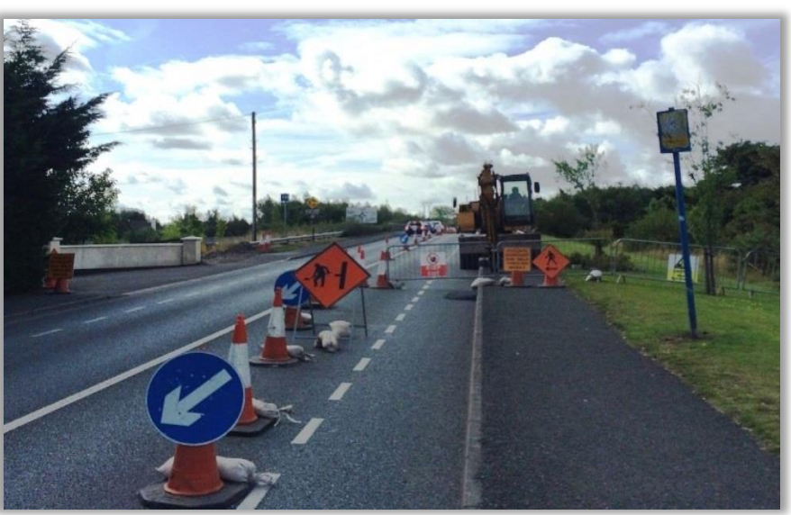
No alternative safe route provided