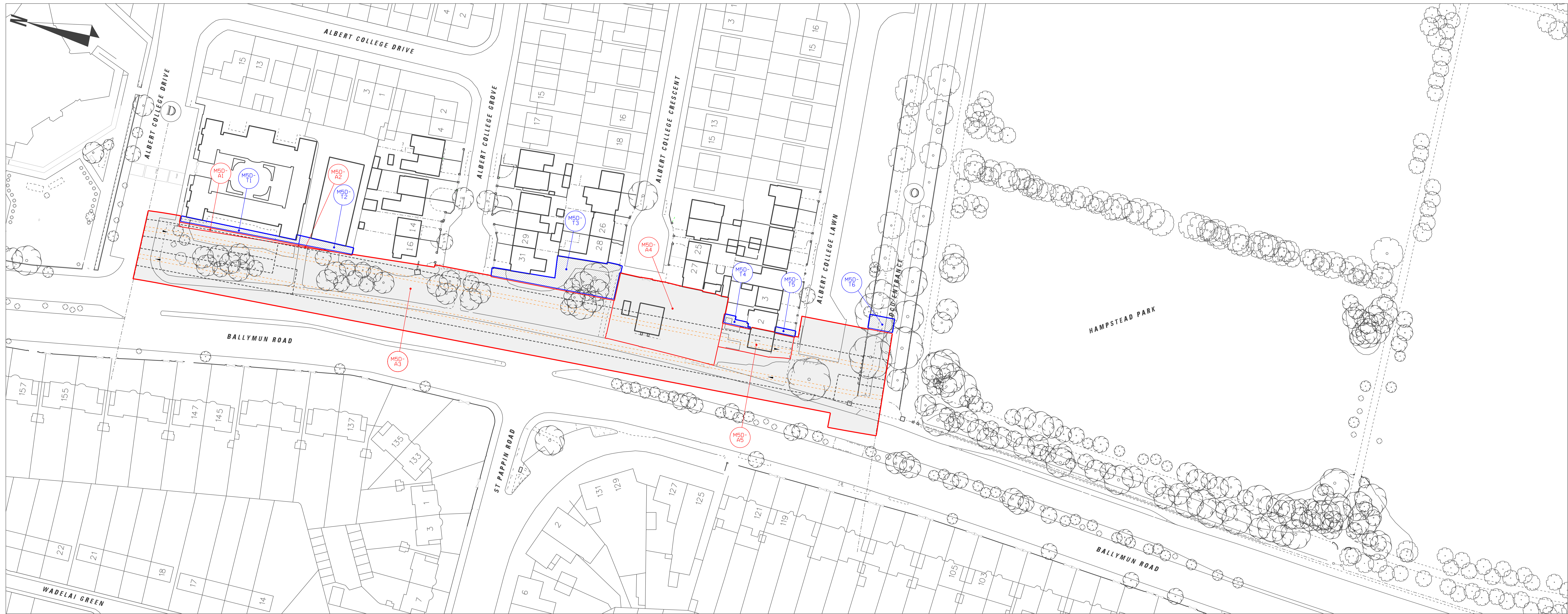
LOCATION PLAN Scale 1 : 500

©Copyright Railway Procurement Agency This drawing is confidential and the copyright is reserved by the RPA. This drawing must not be either issued, copied or otherwise reproduced in whole or in part or used for any purpose without the prior permission of the RPA. All U.S. data used for plans is generated from U.S. digital data and was printed under Ordnance Survey permit no. 03.001