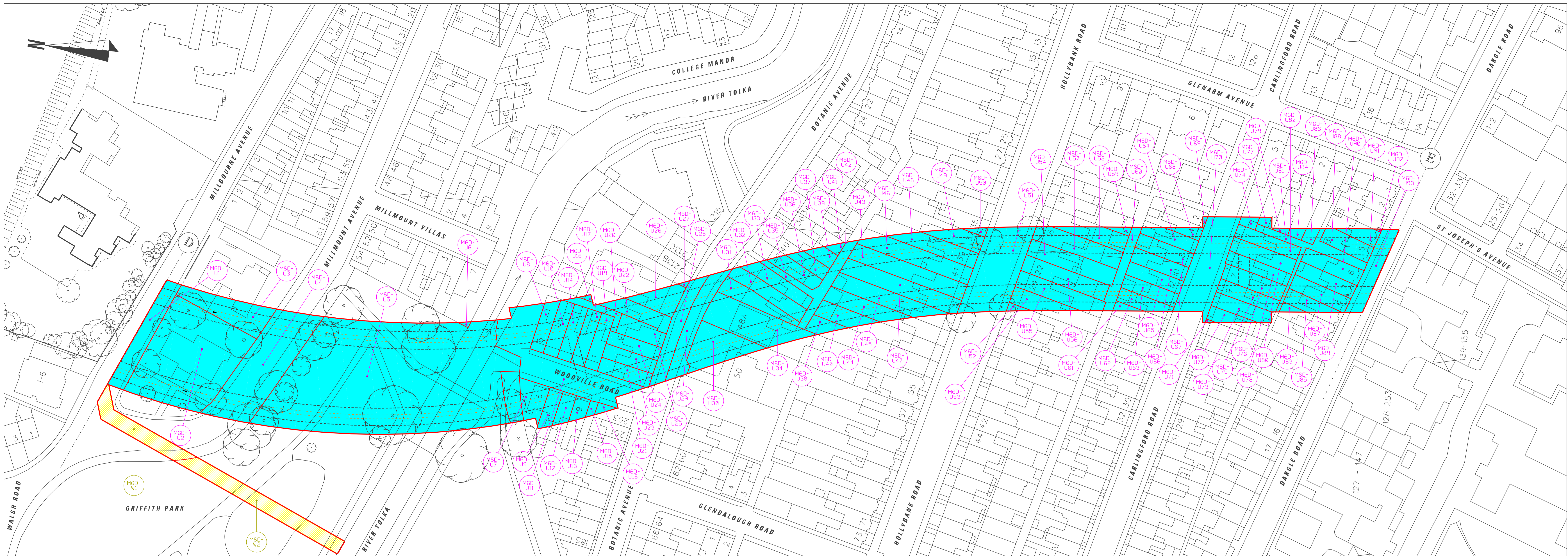
LOCATION PLAN Scale 1 : 500