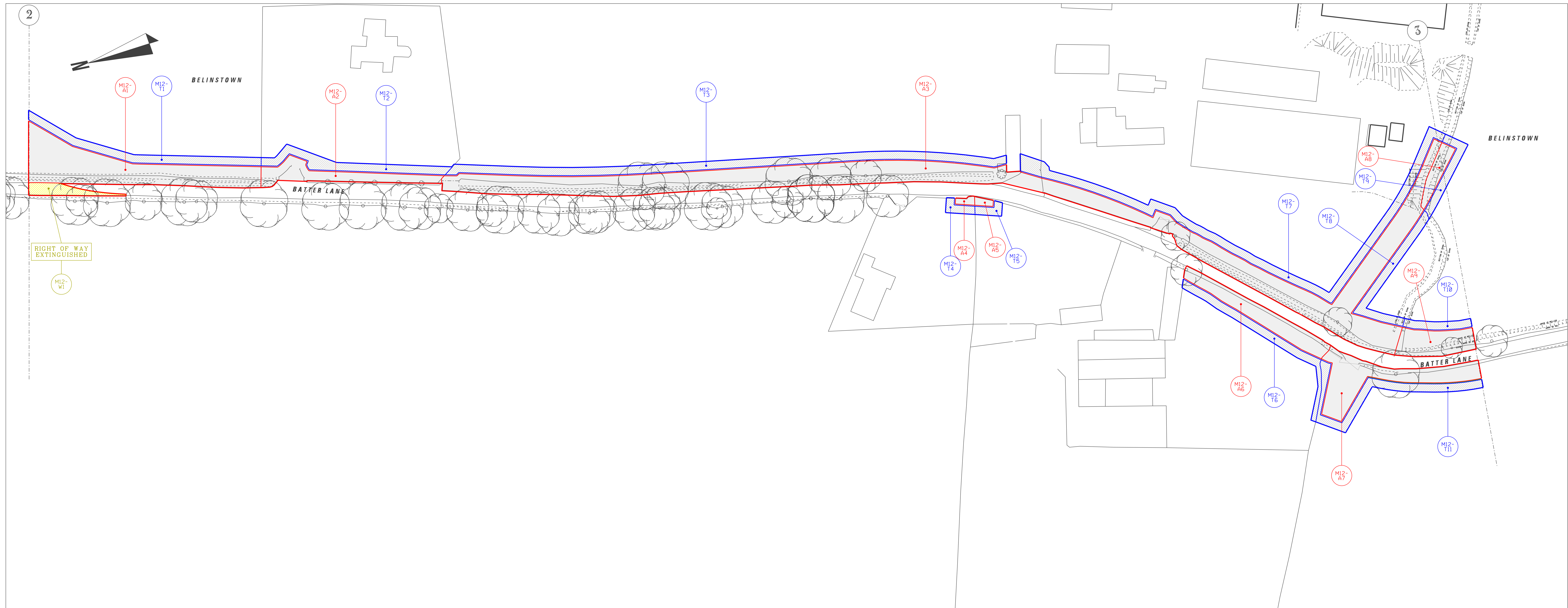
LOCATION PLAN Scale 1 : 500